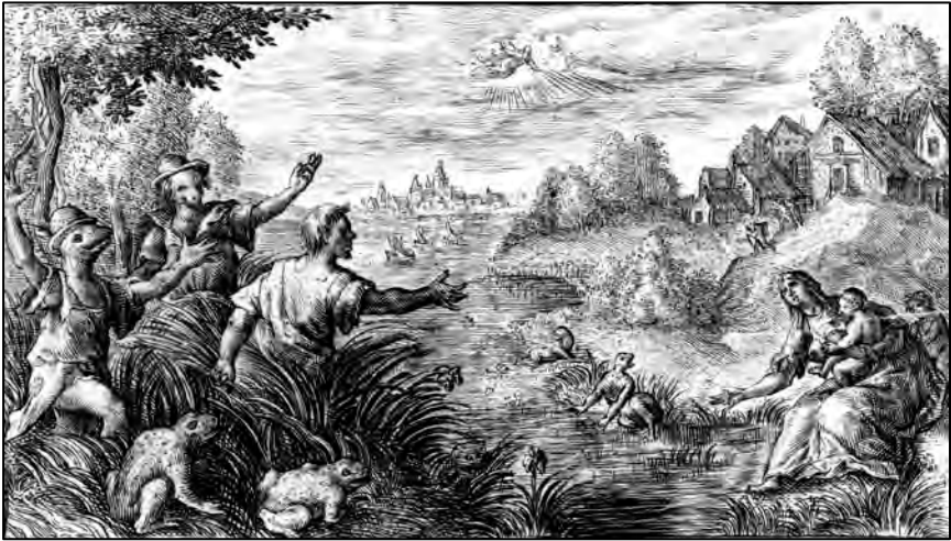
Latona turning the Lycian farmers into frogs

are essentially civilised, the raw is cooked, and the wild tamed wherever possible. The human defence against the disorder that breaks in on us is affection, loyalty, endurance, and trust. Nature is ambiguous, often beautiful and beneficent, occasionally cruel and indifferent, a marvellous flow. Ovid is a proponent of civilisation, and of the gentler values of the Goddess, her benign moods and masks. Disorder finds its resolution in renewed order through transformation, rather than catharsis. Tragic terror is evaded, as a response, in favour of pathos, a saddened recognition of human frailty, and the greater powers outside us and within us.