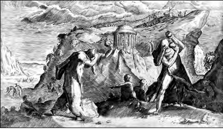
Deucalion and Pyrrha create a new race of men

And Ovid is moved enough to broaden out into extended stories when he finds real beauty in the situation. So, there is the beauty of the marriage of Baucis and Philemon, the touching nature of their wish, and the sweetness of their ending, transformed into trees (Book VIII:611): there is the pathos of the story of Ceyx and Alcyone, their expressions of married love, the disaster of that tempest, another source of Shakespearean effects, and the sadness of loss and grief at the death of a partner (Book XI:410), an echo of that of Procris: and there is Orpheus finding his Eurydice again in the fields of Elysium (Book XI:1). Each of these scenes benefit from Ovid's real feeling for enduring love, and he pours some of his sweetest words into the idea of marriage.