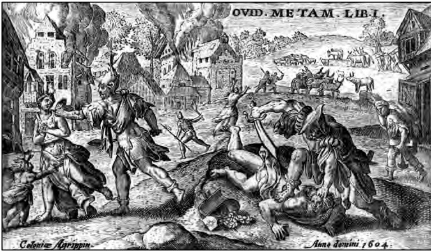
The Iron Age

of the earth, and the land moves from common access to the light of the sun and the air for example, to private possession. (Book I:125). This is echoed again by Latona (Book VI:313) who declares that sunlight, air, and water are a universal right, free to all. Nature has granted them in common: only humanity creates ownership. The text is asserting that ancient view of things held by nomadic and hunting peoples, an inability to understand how land can be owned, a focus on the paths across territory, and the knowledge of where best to find resources, rather than on demarcation, boundaries and surveying.