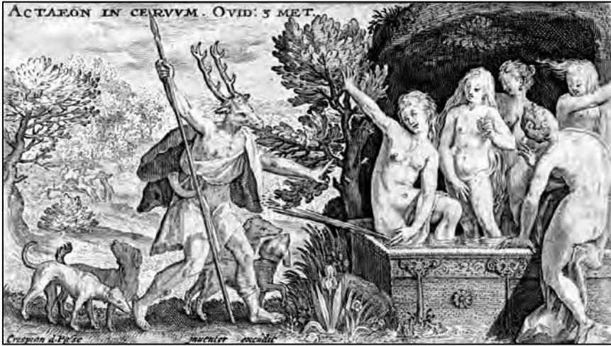
Diana and Actaeon

(Book VII:614), or from inert matter like Galatea, the statue that turns into a living girl (Book X:243), and even creating dolphins from Aeneas' fleet of ships (Book XIV:527).