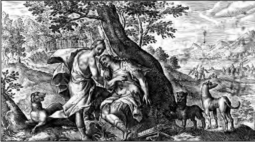
Apollo and Hyacinthus

face of mortality, holding that Spartan loveliness 'robbed of the flower of youth' (Book X:143). Apollo is forever cradling the dead mortal, pitying the extreme, inspiring the beyond-human effort of vision or creation.