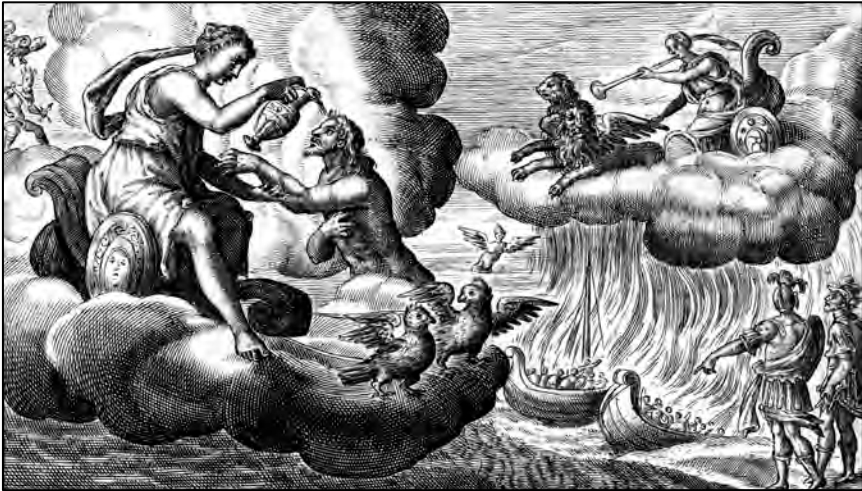
Venus immortalises Aeneas

Woven within the history are the gods and goddesses, and they provide a strong element of continuity, the goddess and the god in their many manifestations, returning and displaying their characteristics. They too are a part of the dance, a vital part, and as masked dancers they afford us recognition of similar forces acting throughout the tales, forces of 'human' interaction and passion. Disguised as humans the divinities cause havoc, and interfere with human affairs. Piety is a real need, to be able to recognise, and respect, the divine and sacred. Failure to do so leads to disaster, a result of hubris , of pitting oneself against the greater forces. The gods and goddesses enter into human life: the world of the divine and the human is a continuum. In such a continuum it is easy to fall foul of a deity.