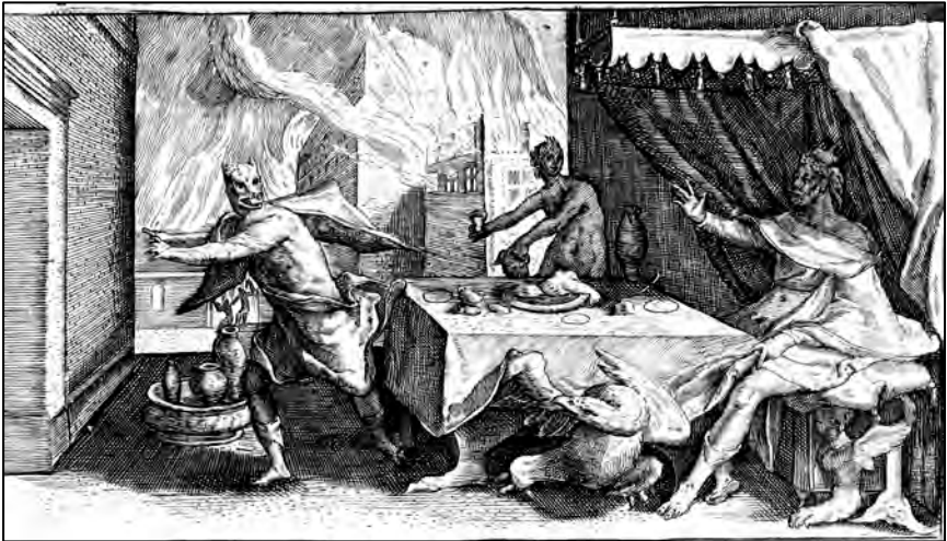
Jupiter turns king Lycaon into a wolf

Many of the tales deal then with personal excess, the result of pride or passion or impiety, but treated in a manner that draws out the pathos of the innocent victim, or the appropriateness of the resolution for the protagonist. So, Nyctimene's incest ends in her transformation into an owl, while she is 'conscious of guilt at her crime, and flees from human sight and the light, and hides her shame in darkness, and is driven from the whole sky by all the birds.' (Book II:566). Or there is Pyreneus, who threatens the Muses, and falls headlong to the earth below as he tries to follow their winged flight (Book V:250). Or the impious Lycians turned into frogs by Latona (Book VI:313). While Procris a victim of Cephalus' error, dies loving her murderer, her own husband (Book VII:661), and Hesperie falls an innocent victim to Aesacus passion and a snake in the grass (Book XI:749). Ovid's humanity is engaged by those destroyed by excess, and often his sympathy extends to the sinner as well as the sinned against.