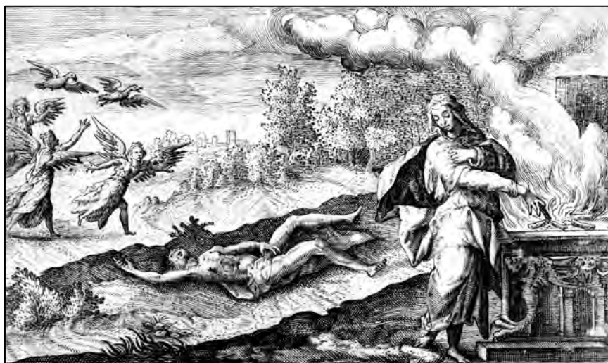
Althaea kills Meleager