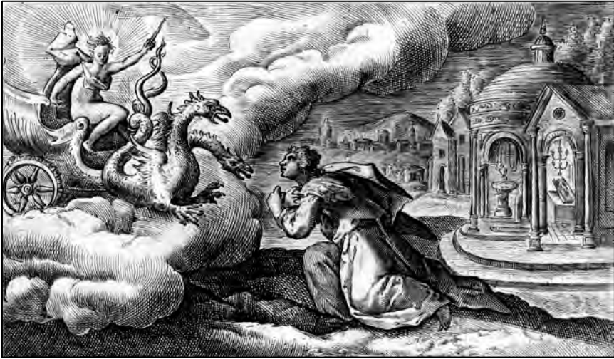
Medea invokes Hecate

X:86). He sings the fate of Adonis 'dying on the yellow sand' transformed to the anemone flower, 'lightly clinging, easily fallen' (Book X:708).