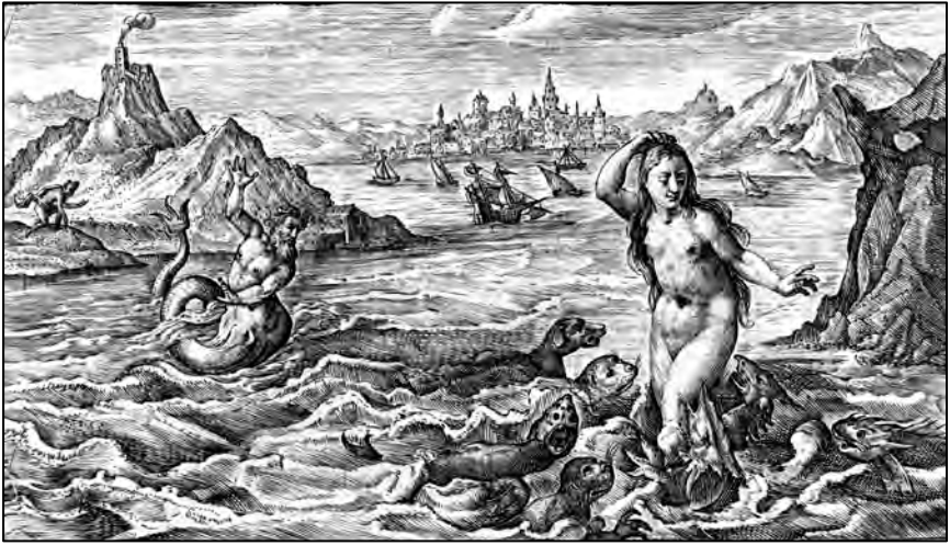
Circe turns Scylla into a sea monster

cool-eyed, remote, inviolate, virgin self, the private, shape-shifting, birdlike intellect, that wings above the world, to pass by as a swallow and touch us, to perch in the rafters and chide and remind us, to swoop as a kite or a kestrel and snare us, to dance above the waves like a sea-mew and aid us in our distress. She is the inspirer of crafts and cunning, of intellect and scholarship, of weaving and navigation, of mathematics and horsemanship, of the loom, the earthenware pot and the flute, and the olive branch of peace. She is the goddess of the domestic arts, protective of the girls who worship her, and the heroes, especially Ulysses, who revere her.