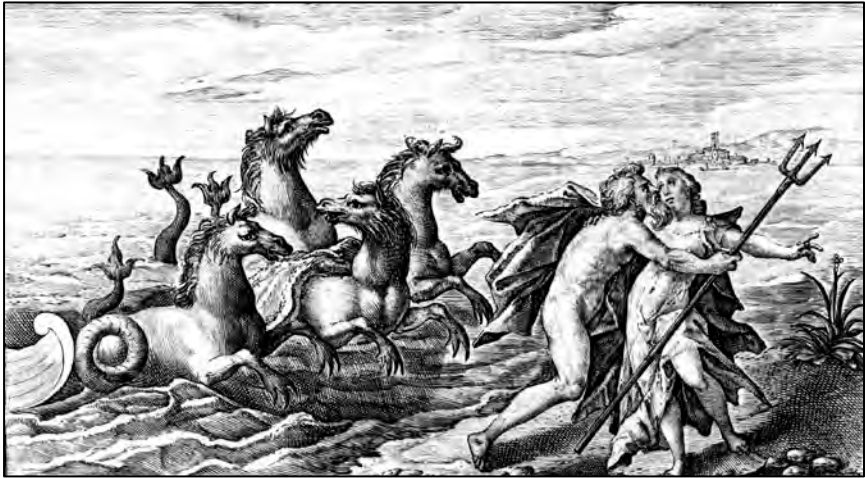
Neptune rapes Caenis

Eros-Cupid, to chance and misfortune. Hyacinthus, and Adonis are accidentally killed (though their deaths relate to older myths of divinity and its consort). Apollo and Venus weep over the bodies of the beloved. The transience of mortal life is obvious, and no sacrifice or catharsis, no prayer or invocation can evade time and death. In the marketplace at Athens, says Pausanias (Book I.17.1) 'is the Altar of Pity, not known to everyone.' It is the ancient altar of the Twelve Gods, excavated on the north edge of the Agora.