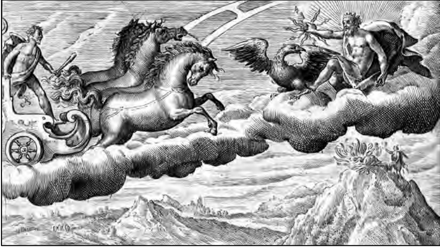
The ascension of Hercules

(Book VI:103). In order to rape Io he hides himself in a covering mist (Book I:587). Through the girls he transmits his divinity, creating heroes and gods, Mercury, Bacchus, Minerva, Apollo and Diana are his divine children by them, Hercules, Perseus, Minos and Aeacus are among his mortal sons.