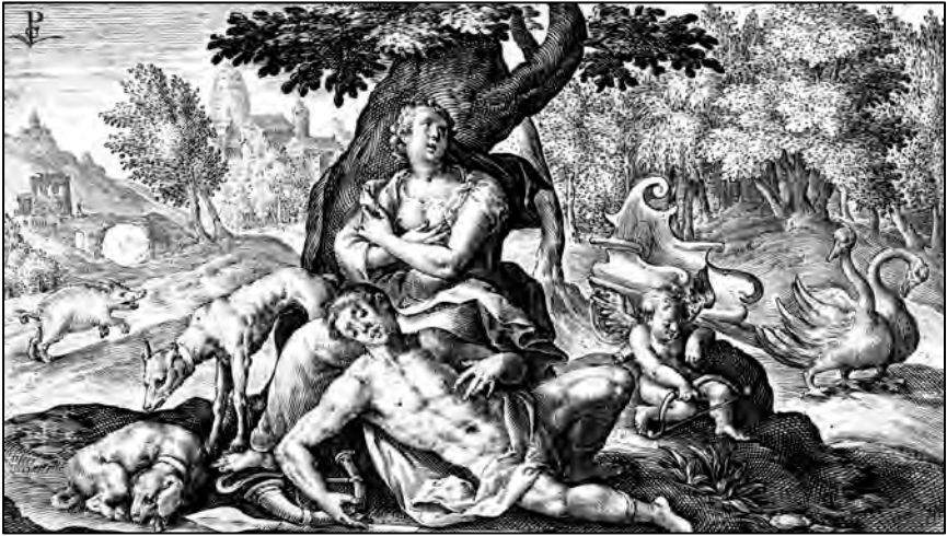
Venus mourns Adonis

space of the goddess, with impunity. Nevertheless Ovid accentuates her compassion in his selection. Offended by Arachne she contested with her in weaving and punished her effrontery and her skill by beating her over the head, seat of mind and invention, but then when the girl tried to hang herself, pitied her and turned her into the hanging spider (Book VI:1). And so she saves Cornix, since 'the virgin goddess pities a virgin', and turns her into a crow (Book II:566). And turns the falling Talos, plunging from her sacred Acropolis of Athens (Book V:642), into the low-flying partridge (Book VIII:236).