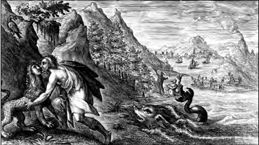
Peleus and Thetis

Most of the scenery in Ovid's theatre is pastoral. The stories take place in the open air, or in ancient Greek cities, the size of our small towns, open to the sky, and continuous with nature. It is the world before modernity. Nature is beauty and charm, a place of delight, out of which the gods and goddesses emerge with fatal force, involving themselves in human lives, and evoking a response. Nature is the goddess, in her most ancient, her Palaeolithic and Neolithic, form, and Ovid is telling us that as such she is sacred and enticing, inviolable and nurturing. She is the matrix of humanity and its erotic root. As such she is passive and welcoming. In her sacred and inviolable mode, nature as given to humanity, untouched and mysteriously present, she is virgin, she is Diana-Artemis, the Lady of the Wild Creatures, or Minerva-Artemis, goddess of Mind and invention, of women's arts and crafts. In her seductive and erotic role, nature as passion and procreation, she is Venus-Aphrodite, and the magical witches and shape-shifters who are her masks, Circe (Book XIV:1) and Medea (Book VII:1), Thetis (Book XI:221) and Mestra (Book VIII:725). In her maternal and nurturing role,