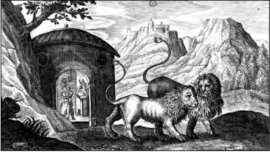
Atalanta and Hippomenes changed into lions

So we find the Goddess, in Ovid's work, in all her manifestations, as virgin girl and woman, as lover and bride, as mother and mourner. She is Nature and the inviolate sacred circuit of the moon and stars. She is Mind and the untouched private world of the creative soul. She is Beauty and Love. She is all that is deepest and most complex, all that is least definable and most obvious. She is power, too, but not the power of violence and possession, rather the power to stir the heart and spirit, in the way the younger gods can. So that Apollo and Mercury, art and the word, link to Venus and Minerva, beauty and mind, in a circle of love. And Bacchus-Dionysus and Diana-Artemis keep alive the wild instinct in the civilised human being: keep alive the spiritual sources of our psychic energies, in our biological continuity with the animal kingdom, and the ecstatic inspirations of the night-bound universe beyond us. What is above, and below, is also within.