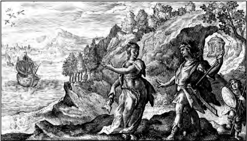
Medea aids Jason

The face of the god appears and disappears. It is the same power manifested in many forms, which are all one essence. So the many girls pursued by the god, taken by the god, are the same girl, her pale shining face like a reflection of the moon in the water, her fate taken out of her hands, her destiny to be a vehicle for the divine. And the transient betrays them. The gods betray mortals, because their attention moves on elsewhere, leaving them behind, all those lost girls, their beauty vanishing, their lives consumed, and all the aged heroes, their function complete, their conquests, and labours, and explorations over, the gods transforming mortals and passing on by. And as the gods betray women so do their lesser images the heroes, they too betray. Theseus abandons Ariadne (Book VIII:152), Jason is false to Medea (Book VII:350), Aeneas follows his own fate not Dido (Book XIV:75), Ulysses parts from Circe and Calypso (Book XIV:223).