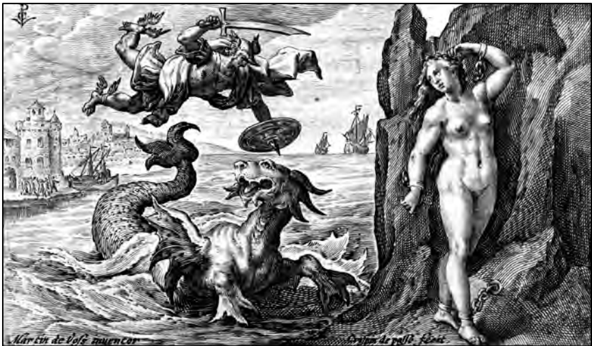
Perseus rescues Andromeda

Otherwise woman must enter the world of male power. She must undertake the risk of relationship. There, if she does not fail in her womanhood like the hard-hearted Anaxarete (Book XIV:698), or prostitute and objectify herself like the Propoetides (Book X:220), she is likely to become the helpless victim, Semele (Book III:273) or Echo (Book III:474), Iphigenia (Book XII:1) or Hesperie (Book XI:749). In response she may be perverted or corrupted by suffering, and retaliate, as Philomela and Procne do (Book VI:619), or Althaea (Book VIII:451), or Hecuba (Book XIII:481). Or she may die not merely bravely like the daughters of Orion (Book XIII:675), but asserting her rights as Polyxena does (Book XIII:429), or like Caenis, seek to escape woman's fate and become male (Book XII:146). In the background Cyane cries woman's violation (Book V:385), Latona our right to a world of compassion, where what Nature gives is shared and free to all (Book VI:313).