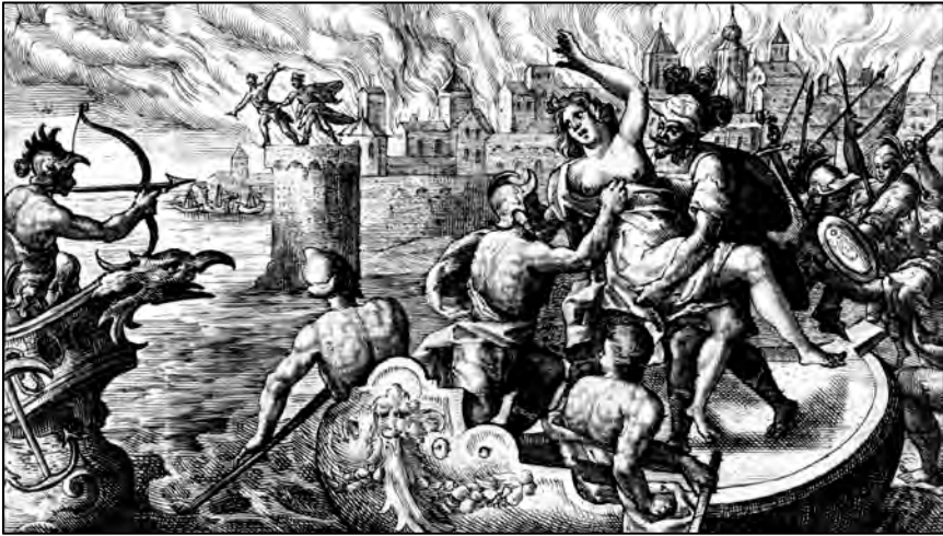
Ulysses drags Hecuba from the graves of her sons

Or others may be our fate. It is enough to be born in the wrong place, to be a person caught up in human affairs, in the destinies of the great. So Ovid evokes pathos for Ino, innocent victim of Juno's enmity against the House of Cadmus (Book IV:416), and Andromeda, punished for her mother's failings (Book IV:663), for Hecuba, blameless queen of fallen Troy, and her courageous daughter Polyxena, doomed to be a sacrifice to the ghost of Achilles (Book XIII:429) and for Cassandra, raped in Troy, and murdered later alongside Agamemnon (Book XIII:399).