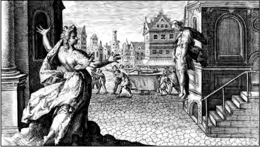
Anaxarete and Iphis

Cyane, whose pool is desecrated (Book V:425), and Canens devastated by the loss of Picus (Book XIV:397) simply waste away, while Semele, mother of Dionysus-Bacchus is consumed by fire (Book III:273), and Echo (Book III:359) and the Sibyl (Book XIV:101) are fated to become voices only.