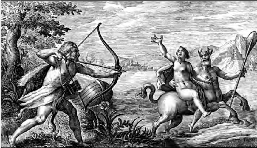
Hercules kills Nessus

lightning: a human encounters one, and like the effect of a stone thrown into a pool, the ripples of consequence follow. Apollo pursues Daphne, and forever afterwards the laurel is his emblem. Jupiter sees Semele, Juno intervenes maliciously, and the girl ends as a heap of charred ash. Actaeon has a single glimpse of Diana bathing and throws away his life. Dis snatches up Persephone and a whole mythological complex of death and regeneration is set in motion. To see a god, to meet a goddess, is the highest of risks. And to be born of the union of divine and mortal, to be a Perseus or Hercules, sons of Jupiter, a Theseus, son of Neptune, a Ulysses, son of Mercury, or an Aeneas, son of Venus, is likewise to be a constant disturber of human events.