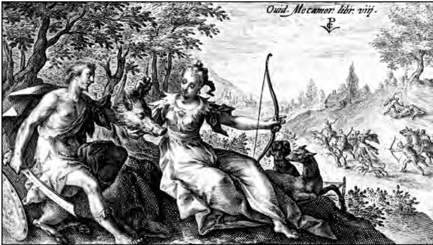
Meleager and Atalanta – the Calydonian Hunt

to his audience and displaying his ability to create interesting incident. His third set-piece, inserted to balance the whole work, is the Lapiths and Centaur' battle in Book XII, preceded by Achilles, the killer on the loose, (Book XII:64) in order that the tale of Cynus can be told. This fracas is relieved only by the pathos of the tale of Cyllarus and Hylonome (Book XII:393), otherwise it is to me an unredeemed excursion into mindless execution.