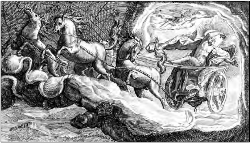
Phaeton drives the solar chariot

flowers of the grass.’ ( Fragment LP: i.a. 16 ). If only we too had her works in whole and not in part.