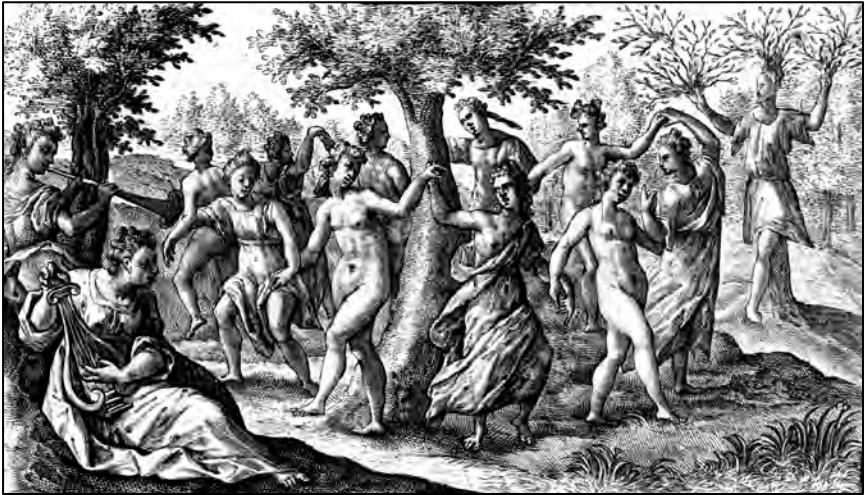
The Apulian shepherd turned into an olive tree

honeycomb of the Metamorphoses , cell by cell, filling the spaces of time, threading the levels and layers of the comb, transforming the tales to gold. The god roars in his temple, the bull bellows at the heart of the labyrinth, but here the Goddess dances across the shining floor, and the golden honeycomb drips the pure honey of the dancing bees, those intoxicated, beautiful, obsessive creatures, whose dance points the way to the meadows, the flowers, and the pollen. Some are left behind too, dead bees, living works, the traces of the artist, threaded on the necklace of the Goddess, the line of the creators, from ancient times till now. 'For joy's sake take my strange gift,' says Mandelstam, 'this simple thread of dead, dried bees, turned honey in the sun'. Don't go to Ovid for the temple, look for that elsewhere. Ovid is the dance.