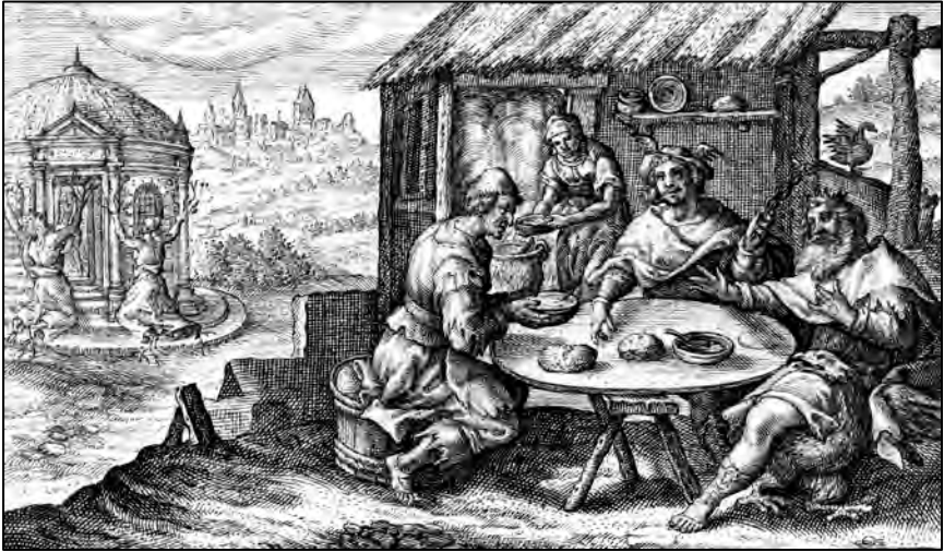
Jupiter and Mercury visit Philemon and Baucis

impiety, and clambering up the mountainside they see their own house transformed into a temple of the gods. Jupiter now grants them a wish, and the essence of the story is contained in their response. They wish the piety of their lives to continue by becoming priests of the temple, and the harmony of life to be continued in death, by relinquishing their lives at the same moment. The god grants their wish, and they are metamorphosed in death into two trees, an oak and a lime tree, symbols of the two gods.