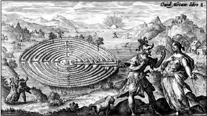
Theseus and Ariadne

In Crete, the first of Daedalus' creations was the wicker-frame in which Pasiphae, Minos' Queen, driven by passion, disguised as a heifer, mated with Neptune-Poseidon's white bull from the sea. Crete of the bull-leaper frescoes, and the double-headed moon-bladed axes, gives also this mysterious story of unnatural love and procreation, the dream of passion creating monsters, creating the Minotaur half-human, half-bull, a metaphor for Minos' power. Daedalus then made a Labyrinth (Book VIII:152) beneath the palace of Cnossos, in which Pasiphae's child, the Minotaur, Asterion, might be imprisoned. The self of humanity, part creature, part human, is locked away inside the maze of inner being. An image of that buried continuity with the animal world, which is also a buried challenge to our civilised existence. Outside, in the free air, Daedalus also created a dancing floor for Ariadne, the creature's half-sister, daughter of Pasiphae and Minos, sister of Phaedra. It was a space where the Cretan delight of ritual movement might be exhibited, in that society where women, as Plutarch says, in his Life of Theseus , took part freely in the games, as at Sparta. Ariadne is one more incarnation of the Great Goddess, her dance a bird-dance perhaps, of the ritualistic mating partridges of Phoenicia, or a maze dance, echoing the labyrinth beneath her feet, or a dance of stars and constellations, or a dance of the bees in front of the hive, signalling the path to their flowered pastures.