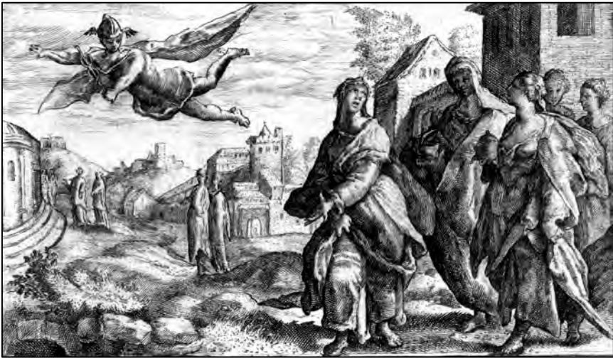
Mercury sees Herse

Then there are Mercury-Hermes, messenger and trickster, Vulcan-Hephaestus the smith and god of fire, Mars-Ares, the god of war, and the panoply of lesser gods, of the winds, rivers and seas, and the more ancient masks of the Great Goddess that survive like fragments of ancient sculptured faces in a ruined temple, Vesta-Hestia, Themis and Latona, Dione and Cybele. There is a whole ethos, a paradigm, of spirits and forces, powers and deities, filling the world.