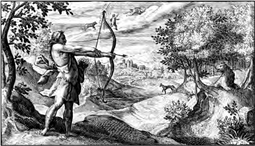
Arcas draws his bow on Callisto

union, though he himself attempts to lessen his own intensity. Semele's own request, prompted by Juno, condemned her. A god, Dionysus-Bacchus, is born of their act. (Book III:273). Juno is angered by her sister Ino too, another daughter of Cadmus, whose child Learchus is killed by her maddened husband Athamas, while she herself becomes a sea-goddess (Book IV:416) Leucothoe: she, the same Ino 'of the beautiful ankles' who was 'touched with pity for Odysseus' and 'rose from the water like a sea-mew on the wing' to aid him. ( Odyssey V.333). She is one of four ill-fated sisters, since Pentheus, the son of another sister, Agave, is destroyed by Bacchus' followers including his own mother, and Actaeon, her sister Autonoe's son, transformed into a stag, is torn apart by his own hounds at Diana's prompting (Book III:165). The House of Thebes has far too much involvement with the gods.