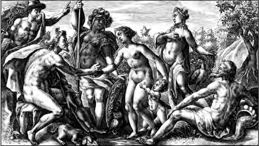
The judgement of Paris

Athene's) hostility to Troy, and to the Trojan race personified in Aeneas. She sends her messenger Iris to destroy his ships (Book XIV:75), and aids Turnus in the wars against him in Latium (Book XV:745). And later, still pursuing his descendants, she unbars the Roman citadel to the Sabines (Book XIV:772). Only Perseus, of Jupiter's heroic sons, seems to escape her attentions: but then he is an Argive, and of her city.