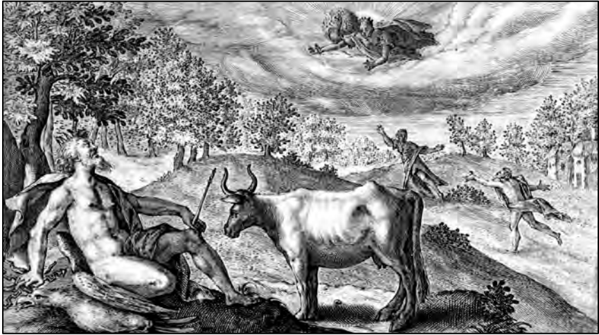
Jupiter transforms Io into a heifer to hide her from Juno

XIII:481), and the city of Ardea a grey heron (Book XIV:566). It is as though Nature is capable, with minimum intervention by the divine forces, of triggering the resolution of their story.