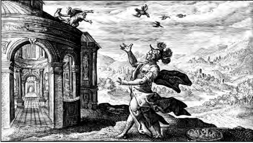
Minerva transforms Talos into a partridge