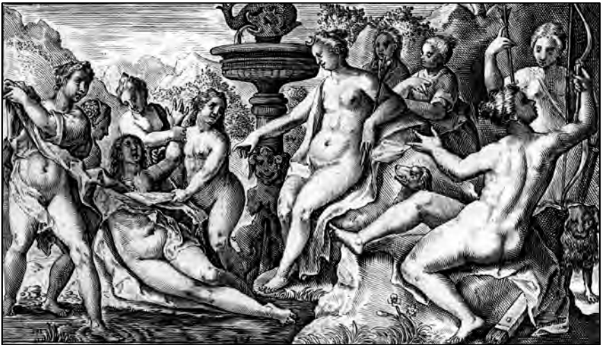
Diana and Callisto

III:165). There is Europa, drawn out to sea by sly Jupiter, sitting astride the bull's white form, while her clothing blows behind her in the breeze (Book II:833). There is Narcissus by another 'unclouded fountain, with silver-bright water' that is untouched and inviolate, watching his reflection under the shadows of the trees, and falling for himself, chasing the fleeting and intangible image (Book III:402). Salmacis entwines Hermaphroditus in the pool 'clear to its very depths', clasping his ivory-white neck (Book IV:346). Perseus rescues the virgin Andromeda, blushing through her warm tears while chained to the rock above the waves, where he hovers in his light armour, wings fluttering on his ankles (Book IV:706).