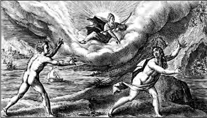
Alpheus and Arethusa

There are eight or more transformations to water, including Marsyas, loser in his music contest with Apollo, who becomes a river (Book VI:382), as does Arethusa pursued by the river-god Alpheus (Book V:572), and Acis, destroyed by Polyphemus (Book XIII:870). Helle, falling from the golden ram (Book XI:194), and Icarus (Book VIII:183), whose waxen wings melted, give their names to seas. The incestuous Byblis becomes a fountain (Book IX:595).