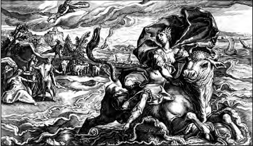
The rape of Europa

Jupiter-Zeus, supreme king of the gods, son of Rhea the primal Goddess, and Saturn whom he and his brothers, Neptune and Dis, deposed, is the essential focus of divine power. He is a god of mountains, of heights. Born on Mount Lycaeus in Arcady, hidden and nurtured on Cretan Mount Ida, he rules from Mount Olympus. His chief sanctuary was Dodona, in the expressionless nowhere of northwest Greece, itself once a grove of oracular oak trees, beneath Mount Tomaros, inherited from the more ancient Goddess, Dione. As naked power Zeus is the lightning flash and the sound of distant thunder. He has, in a sense, no real face, and no distinguishing features. He is kingship, Imperial power, neutral, sovereign, and ruthless in its rough justice. When Zeus descends among mortals he must therefore appear in disguise. He is a white bull, abducting Europa (Book II:833) or an eagle snatching Asterie and Ganymede (Book X:143), or a swan mounting Leda (Book VI:103), or he mimics the goddess Diana to deceive Callisto (Book II:417). Arachne depicts his many deceptive forms on the web she weaves: a shower of gold, a satyr, a flame, a shepherd, a spotted snake