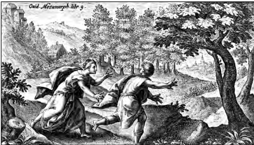
Byblis and Caunus

The gods are those same strangely amoral forces that Homeric literature created, representing the power of nature and fate, the way in which the world can seem to align itself with mortals, and then discard them. The gods bring passion and the embrace of something akin to love, but they also bring desertion and betrayal, an injustice that goes hand in hand with justice. They support but they also persecute, they grant gifts but they also destroy. Man humanises his postulated divine, his imagined gods, and yet, to conform to the neutrality and non-alignment of nature, they must also be pitiless and indifferent, as well as nurturing and protective. The best strategy for human beings is to follow the middle way, avoiding competition with the divine, eschewing lust, pride, vanity, greed, gratuitous violence, walking cautiously, taking care to identify and respect the presence of the gods. But avoidance is not always possible. Certain events are destined. Certain characters become protagonists in actions and tragedies beyond their own control. Certain characters have weaknesses that in the intensity of the divine light become fatal flaws that precipitate disasters. Excess results in self-created or divine vengeance. Crime that offends the gods is punished. Jupiter-Zeus presides over a rough justice, a royal justice that depends upon his desires and whims as well as on the work of the Fates.