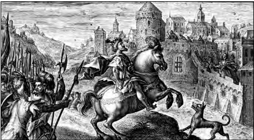
Minos and Scylla

But the gods are not mocked. Running as a thread through the Metamorphoses are Ovid's symbols of order and moderation, law and respect, justice and piety. There is Deucalion the just man, and his wife Pyrrha, who survived the flood, 'no one was more virtuous or fonder of justice than he was, and no woman showed greater reverence for the gods' (Book I:313): there is Minos 'most just of legislators', who recoils from Scylla's passion and her 'impious prize' her father's lock of hair, Minos who 'establishes laws for his defeated enemies' (Book VIII:81), who thinks it 'more useful to threaten war than to fight' (Book VII:453), whose Cretan legal institutions, divinely inspired, were said to have been introduced into Laconia by Lycurgus (Pausanias III.2.4), and who, Homer claims, 'spoke with great Zeus' ( Odyssey XIX:178). There is Aeacus, equally beloved of Jupiter, his people decimated by the plague sent by an unjust Juno, whose island of Aegina Jove repopulates (Book VII:614): and there is Pythagoras, the voice of Ovid's own moderation and respect for the sanctity of life (Book XV:453).