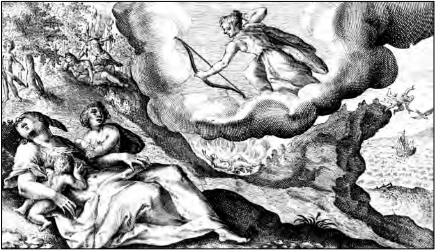
Diana kills Chione