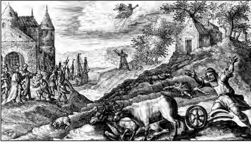
The plague on the island of Aegina

Why such intensity of jealousy? The Great Goddess, being originally a vegetation goddess, takes a consort, the sun god, for her own, each year, and sees him die in winter to be re-born in the following spring. The god is at first subservient to the goddess. It is she who must choose her consort. He is hers and no one else's. When historically the male god eventually usurps her power, and becomes first her equal (competing with his twin, his rival, to be the successor, the tanist, her consort) and then her superior, her resentment and her anger fester. So behind this caricature of Juno, lies the deeper powerlessness of the goddess in the face of male betrayal. From powerlessness in regard to her consort flows her jealousy. All rivals must be destroyed.