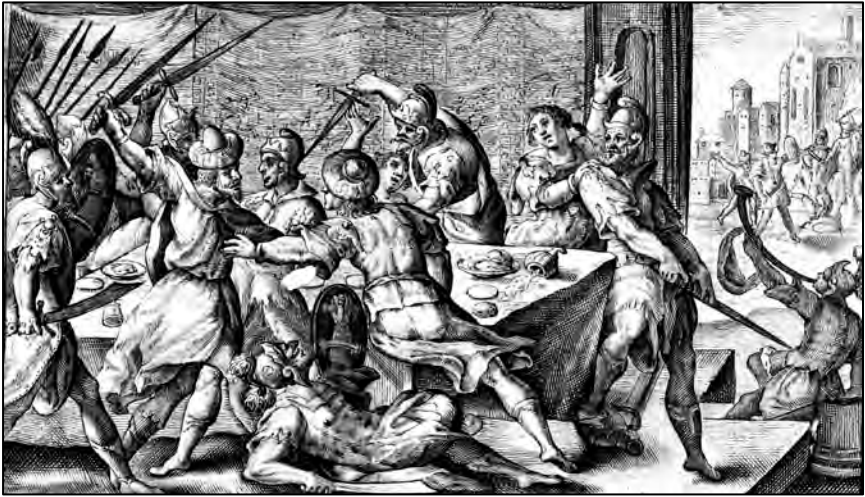
Phineus falls to Perseus

presented the true ugliness and criminality of violence (Euripides: The Women of Troy , The Phoenician Women , Iphigenia in Aulis ). Euripides acclaims Dionysus whose 'dear love is Peace, the wealth-bringer, the saviour of young mens' lives, rare goddess.' (Euripides: Bacchae ) Ovid, less powerfully, reduces male military violence to a puppet play. But perhaps it is no coincidence that it is Bacchus-Dionysus, the presiding deity of Euripides' play, who appears early on to punish the crew of Acoetes' ship, with almost casual power, for their violence and impiety, and to cause Pentheus' destruction (Book III:638).