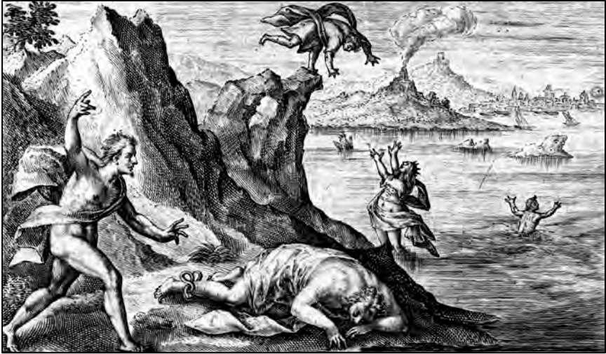
Aesacus pursues Hesperia

Ovid's emotions are excited by innocence, by the pathos of the undeserved fate more than by that of the guilty. It is a core dimension of his feminine, secular, irreligious set of values. The incident of Polyxena hints at his attitude to sacrifice 'No god will be appeased by such a rite as this!' she cries. He depicts the questionable behaviour of the gods as if it were merely an exercise in aesthetics, and the movement of forces, the faces of power: he is sceptical as to their morality. After all, he may imply, anyone, regardless of morality, a Hercules, or a Caesar, for example, can become a god. Only with his treatment of Isis (Book IX:666), and perhaps Bacchus (Book IV:1, Book XI:85), is there the feeling of a mystery, a truly divine side to experience. Only there is there a feeling of invocation. But, I would argue, what Ovid is in fact invoking is the power of pity, what he finds enchanting is Isis, champion of the abused woman, and the unborn child, and Dionysus who rewards and forgives his followers. Rome was ready for a god of pity, a god of the innocent sacrifice, but here all is predominantly human and secular: and mortal emotion, mortal sadness is greater than divine power.