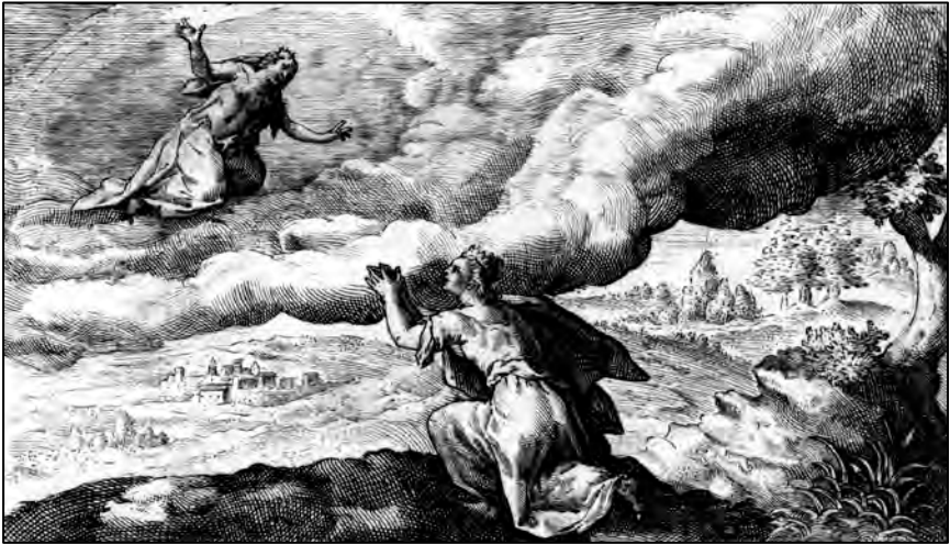
Hersilia is deified

cannot rule. There is speech, for women to articulate their situation: there is courage, and endurance. And sometimes all things come together and there is happiness. Isis helps Iphis (Book IX:764), Venus transforms the statue for Pygmalion (Book X:243), Penelope reclaims her Ulysses ( Odyssey XXIV), Ceyx and Alcyone (Book XI:710), Cadmus and Harmonia (Book IV:563), Baucis and Philemon (Book VIII:679), Orpheus and Eurydice (Book XI:1) are united in death or transformation, as in life. Hersilia is deified to join her Romulus (Book XIV:829).