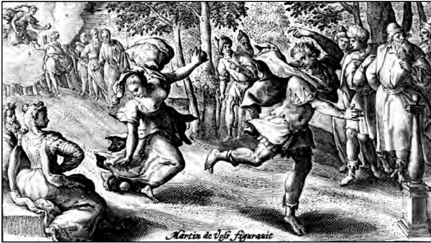
Atalanta and Hippomenes

And Venus-Aphrodite is the goddess of the forbidden, the force that breaks human conventions. Incest is her dark doing. Byblis loves her brother Caunus, and, as she soliloquises, there is divine precedent in that 'the gods have possessed their sisters' (Book IX:439), while Myrrha sneaks into her father's bed: after all, do not 'the creatures mate indiscriminately', and surely it is only 'human concern that has made malign laws.' (Book X:298).