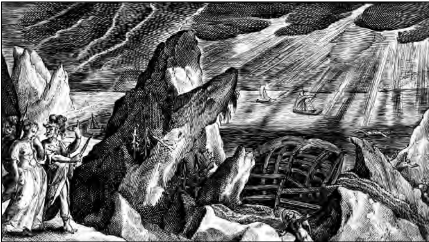
Ceyx returns to Alcyone from the shipwreck

intangible, creating awe and fear, concern and anxiety, respect and reverence. So Pallas Athene, that Minerva of the Mind, and Artemis, that Diana of the innermost essence of being prior to civilisation, are virgin. They stand back from the actual. They intervene through the brain and the nerves. They are a sisterhood, a band of immaculate creatures awaiting human reality, a sacred potency. Venus-Aphrodite and Juno-Hera, on the other hand, represent the sexual, outside and within marriage, woman engaged with the world, as lover, mother, wife and companion. The male gods are one god, actual, involved, as the heroes are. And so in a sense are the involved goddesses. Juno supports the Greeks, Venus mates with Anchises and supports the Trojans, and therefore the Romans. Juno comes to women in childbirth: Venus adorns them with beauty. Venus and Juno play out the antagonism between sudden ruthless passion and civilised, stable partnership. Juno and Venus are part of that spectrum of the goddess that is involvement in human relationships, while Diana and Minerva are that part of the Goddess's spectrum that lies both within and beyond relationship, in the mind and the body, intricate and personal, intense and secretive.