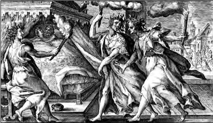
The Furies visit Tereus and Procne on their wedding night

than their lot dictated. He has a quiet admiration for Medea and Circe, for Polyxena ('take the hands of man from virgin flesh!' Book XIII:429), and Daphne( 'free from men, and unable to endure them' Book I:473). His heroes are often faintly ridiculous, creatures of force and bombast, his true heroes, his ' heroides ', are women, mostly modest, reticent, brave, victimised, sometimes courageous, passionate, forceful. And Ovid avoids the more deliberately criminal women of the myths: there is no picture of adulterous and murderous Clytemnestra here, or perjuring obsessive Phaedra, only echoes of their activities. His women of terror are the Maenads, or Procne: maddened Furies, the agents of conscience and retribution, enacting vengeance for the violation of the sacred.