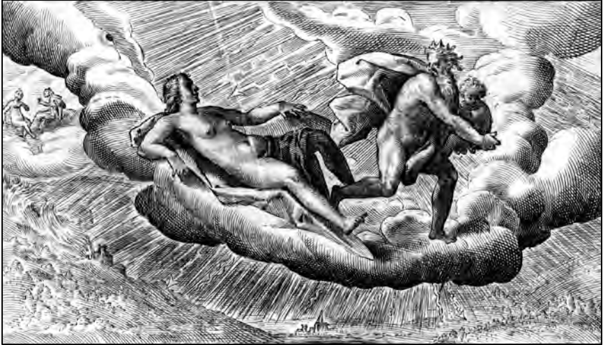
The death of Semele

The gods in Greek myth are an intensification of the human. Entering the world, interacting with it, taking on the forms and surfaces of human beings and creatures, they initiate events by their presence. They are powers. Mating with mortals they charge history with the numinous, creating human destiny. Fate appears as chance and circumstance, but destiny is divinely initiated. Venus embraces Anchises, the mortal, and Aeneas is propelled on his path towards the creation of the Roman people. Jupiter consumes poor Semele, and Bacchus-Dionysus, is plucked from the destruction. Thetis mates with Peleus, and Achilles already sweeps through the glittering darkness of the Iliad . The first and most potent interference with the human world by a god is always through a pregnant woman. Chosen by lineage or beauty, those fated creatures are the seedbeds of divine intervention. The male gods, Jupiter and his brothers Neptune and Dis, Apollo, Mercury, and Bacchus impregnate the girls who will mediate between the human and the divine. The alien, the indeterminate and unbounded, pierces the world and out of it comes turmoil and the stories. The gods are like flashes of