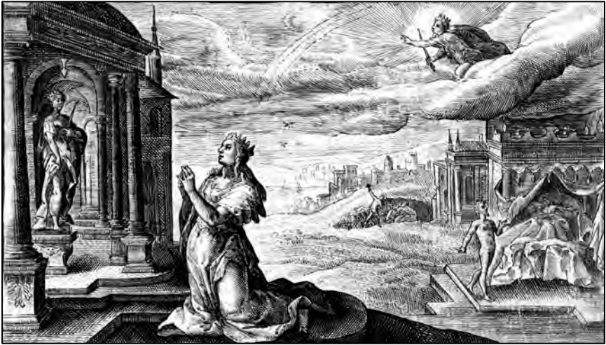
Alcyone prays for the safe return of Ceyx

deep tie of affection binding in death as in life. Unlike the story of Procris and Cephalus the pain of love's loss is almost averted, and the whole tale stands as a symbol of natural harmony, a moral grandeur close to the earth that ends in transformation into the speechless mutual harmony of the trees. It is a deep message from the oldest Greek culture, the antithesis of hubris, an exhortation to 'make the heart small' as the Chinese say, to embrace modesty, humility, quietude and resonance with nature. Ovid who often shows the Roman citizen's gentle mockery of rustic behaviour, and praises civilisation, here shows that he understands the roots of true civilisation, not artifice and political power, but moral clarity, the splendour of living a life that is true, sensitive and kind.