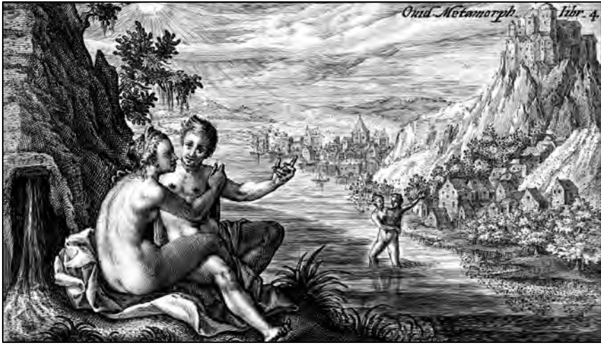
Salmacis and Hermaphroditus

The mix of transformations leans towards the terrestrial, birds outnumbering creatures, and trees and flowers offsetting the waters and stones. Stars and divinities are less evident. Ovid's and the Greeks' sights are on the natural world of earth rather than on the starry heavens, love and passion outweigh punishment, and beauty is a beauty of this life rather than some other. So Nature emerges from the tales and surrounds them. It is the matrix from which things arise, spontaneously on occasion, from the nurturing soil and the moisture of generation. The ancient goddess is passively and implicitly present within it, ready to take back into herself failed, unhappy or remorseful spirits, those whom fate pursues or has maltreated, those who have reached their apotheosis, or their stony termination, the unfortunate and the sinful, the loving and the loved.