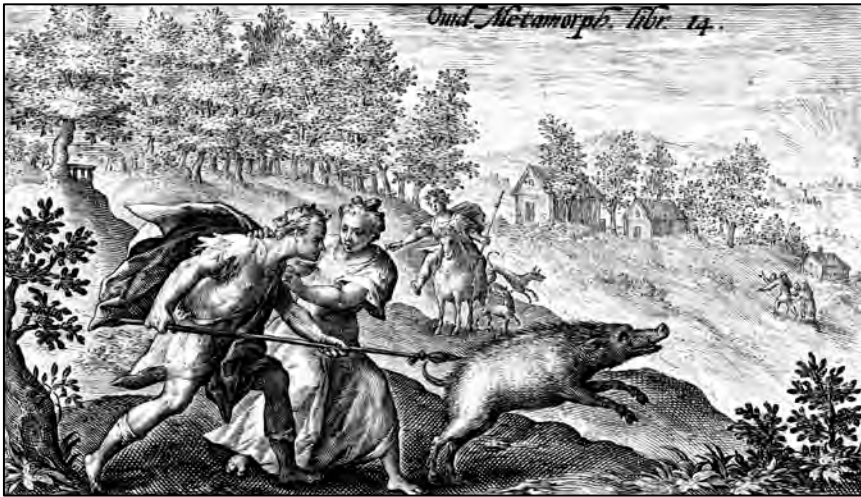
Picus and Circe

Circe, daughter of the fiery sun (Book XIV:1) is first seen enamoured of Glaucus. She is erotically charged 'no one has a nature more susceptible to such fires', perhaps by Venus herself. Spurned by Glaucus she too punishes his preferred love, Scylla. Walking the waves, she then poisons Scylla's bathing place with the juice of harmful roots. Later we find her capturing and enticing Ulysses, and transforming his crew to wild beasts. Again the use of magic is ambiguous, both erotically helpful to her, and yet harmful against those who are not her lovers. Ulysses eventually escaped her delaying tactics, but we see her again enamoured, this time of Picus of Laurentum, spurned by him, and revenging herself on him and his lover Canens with all her occult resources.