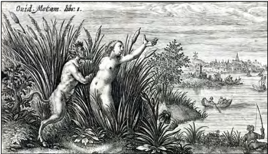
Pan pursuing Syrinx

The rights of woman are sounded also. Daphne, a follower of Diana, is 'averse to being wooed, free from men and unable to endure them', and so Apollo is defeated of his intent, and, transformed, she lives on in the noble laurel (Book I:438). Likewise Pan fails to capture Syrinx, another of Diana's acolytes, who becomes the reed from which his sounding pipes are made (Book I:689). Bacchic freedom gives the Maenads an erotic self-sufficiency on their mountain heights, such that no man dares to cross tracks with them (Book III:692, Book XI:1). And Polyxena 'ill-fated, but with more than a woman's courage' declares the ultimate inviolability of the female spirit, she who has 'no desire to be slave to any man' (Book XIII:429).