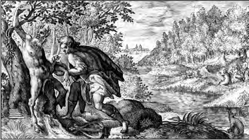
Apollo flays Marsyas

receiving and thanking), that gesture of the mother with her child, and the lover with the beloved, delighting in the presence that comes, almost miraculously it seems, from the sources of being, and in our own ability to give to that presence.