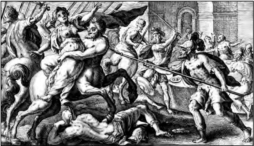
Eurytus seizes Hippodames

Ovid tightens the structure, with echoes between the books. In Book X two thirds of the way through Orpheus sings the stories, while in the earlier corresponding Book V, his mother Calliope, the Muse, sings them. The mock-heroic fight scenes of Perseus and Phineus, the Calydonian Boar hunt, and the Lapiths and Centaurs, are placed in Books V, VIII and XII, to balance and weigh the narrative. And, by pure chance, there is a humble image of the whole work, at its heart, in Book VIII:611, on the table of Philemon and Baucis. 'In the centre was a gleaming honeycomb.'