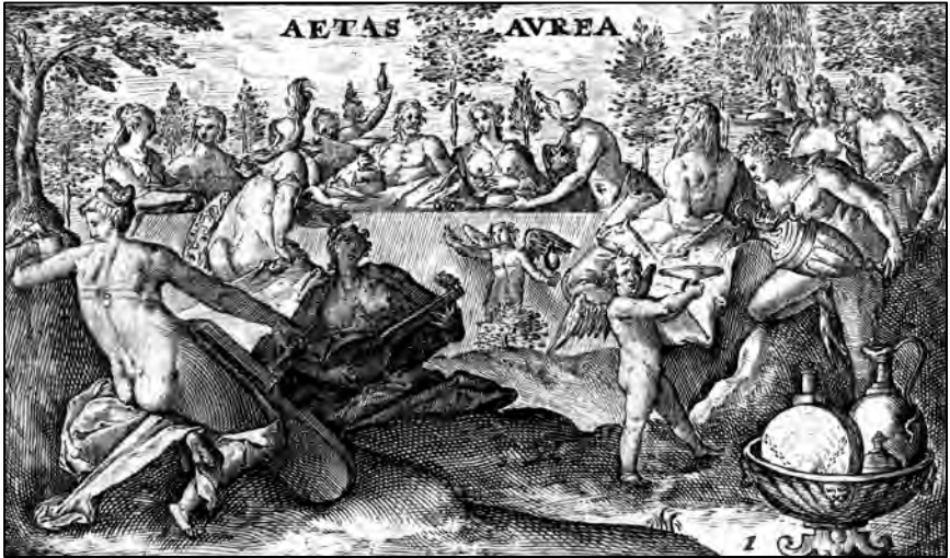
The Golden Age

myths, he softens cruelty and crudity to the extent that he can, making pathos of suffering, tragedy and loss, revealing love and joy, generating visual charm and poetic delight to weave these tales of dark and light. And he weaves them for all time as he knew, and as he proclaims in his closing words. He was gifted with the richness of the flowers of the Greek fields, and he made from them honey for the Goddess.