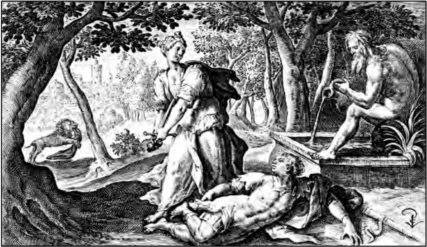
Pyramus and Thisbe

Fate may equally be to be caught up in the affairs of the gods, to be condemned to speak or act, and to be punished as Tiresias is for speaking the truth (Book III:316), or by being taken too literally as the Sibyl was, condemned to endless life but without youth (Book XIV:101). It may be fatal to trespass into the sacred realm, too. Actaeon does, seeing Diana naked, and is punished for his error (Book III:138), as is Dryope, straying beyond the accepted bounds (Book IX:324). Or to cross the paths of the wielder of magic as a rival in love, as Scylla and Canens are afflicted by the angry Circe (Book XIV:1, Book XIV:397), or Glaucus (Book VII:350). The divine, the superhuman, is cruel, and innocence is no defence.