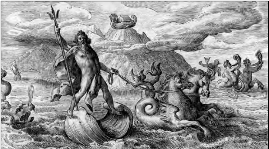
Neptune calms the waves

a driving force. Jupiter, Neptune, and Dis in triad, are the primal energy of the three regions of existence, the light of sky and earth, the realm of the sea, and the darkness under the earth. Juno is that similar energy with a female aspect, the sister-wife. As the supreme forces they are angered by impiety, the failure of respect, and angered by potential or real competition from mortals. The supreme power expects recognition and humility. To ignore a god, or compete with a god, or mock a god is to enter the realm of high risk, and to invite retaliation. But merely to be in the presence of a god, to be noticed by a god, to be desired by a god is fateful, perhaps fatal. That is the nature of power, and force. To stand in the intense light, to face the storm-wind, to chance the tall wave, is to meet the god, and meet fate head-on.