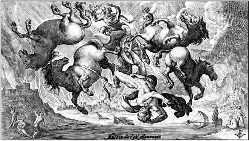
The fall of Phaethon

Ovid's interest in an afterlife, and some place of retribution hereafter, is minimal, his views reflected perhaps in the doctrine of the transmigration of souls that Pythagoras teaches (Book XV:143), certainly he is no Virgil or Dante, dwelling on the possibilities of the Underworld. Aeneas's journey there (Book XIV:101) is passed over swiftly, and Orpheus's visit (Book X:1) is mainly captured in conventional references to some of the famous inmates of Tartarus. His perception is rather of a natural world, where fate takes a hand, and where the final resolution is not so much judgement as re-absorption, the spirit taken back into the realm of nature from which it came, only transformed. The ancient Greek animist world with its continuity, all aspects of nature even rocks and stars possessing 'life', is transmitted through his work, and the natural world of the Metamorphoses therefore feels older than the world of the tragedians, older in many respects than Homer, though in the retelling a Roman veneer is added to the surface.