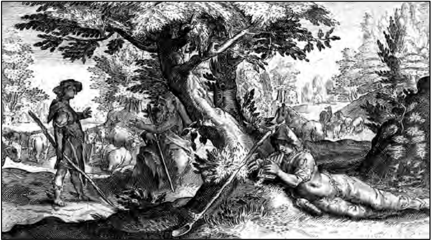
Mercury turns Battus to stone

As god of communication Mercury punishes betrayal by speech: so he turns Battus, the informer to stone, that dead medium, the opposite of living speech (Book II:676), and as a god of paths, doorways and agreements, he petrifies the envious Aglauros, whose sister Hesperes he is in love with, turning her own words into a form of punishing contract (Book II:812).