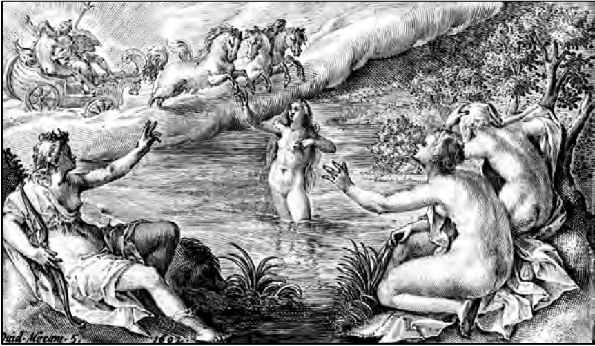
The capture of Proserpine

and guilt, at the worst we will be torn apart and our fluids flow back into the earth that nurtured us.