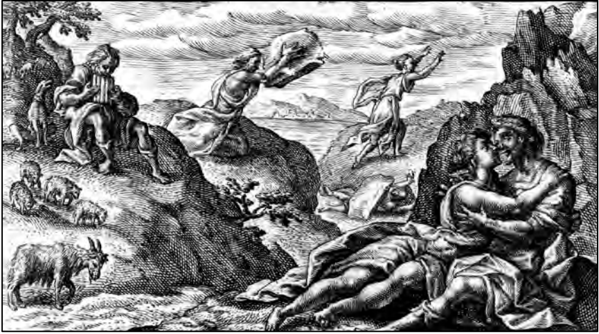
Polyphemus and Acis, beloved by the nymph Galatea

And Nature is overwhelmingly benign, a sanctuary, a place of refuge, where girls can flee from the god, where desolate mothers and wives can sink to rest, where sins of passion are redeemed in forgetfulness and transformation, where crimes are expunged in the silence of stone, or the muteness of birds and beasts. Only once perhaps does Nature itself cause havoc without a seeming cause, when the tempest overtakes Ceyx, and Alcyone finds his returning body, carried to her by the tide. Nature is repetition: ages, cycles, seasons, circuits, masks. The same gods and goddesses perform similar actions, fresh mortals undergo new but familiar emotions. The same faces possess different names, or different forms have the same, hidden, name. The breeze that rustles through Ovid's groves and sighs across his meadows and fields is the wind that stirs the oak leaves at Dodona, the secret whisperings of the ancient natural goddess-filled world, of that Dione behind Zeus, of Themis and Latona behind the later goddesses, or of that Lady of the Wild Creatures on Crete, of that lady of the grassy Neolithic plains, or she of the Paleolithic meadows below the cliff-walls, leading to the limestone caves, and their secretive art.