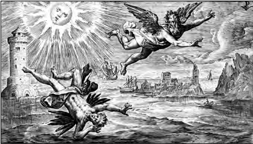
The fall of Icarus

Daedalus meanwhile, persecuted by Minos, has made wax wings for himself and Icarus, his son by Naucratis, one of Minos' slaves (Book VIII:183). Warning his son to keep to the middle way, far from the extremes of the heavens and the earth, they take to the sky, flying eastward. But Icarus in pride, curiosity, and the first intoxication of this new artistry, flies too high, too near the sun, the wax melts, and he plunges down into the waters that are named after him, the Icarian Sea.