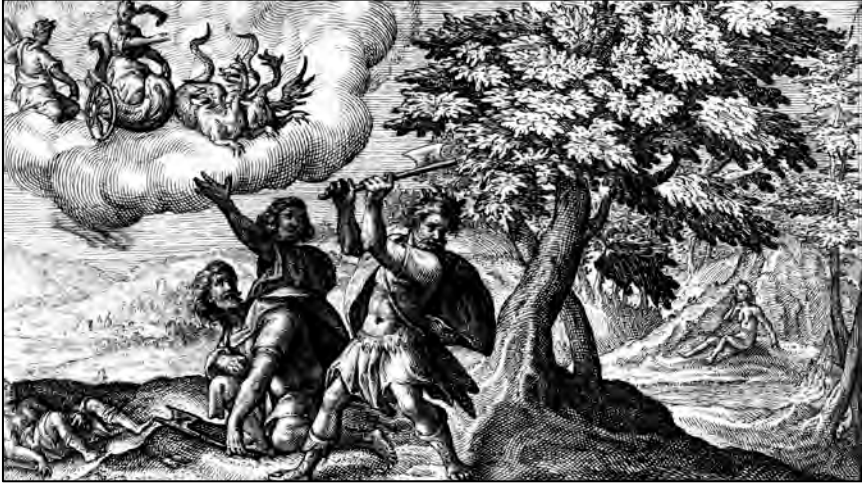
Erysichthon fells Ceres's sacred oak tree

I always wish that I might reach home, and see the day of my return.’ ( Odyssey V:215). And it is Euripides writing late in the darkness of the Peloponnesian War who celebrates, in the Bacchae , most powerful of plays, ‘the life that gains the poor man’s common voice’ and declares that ‘a true and humble heart that fears the gods is man’s greatest possession’