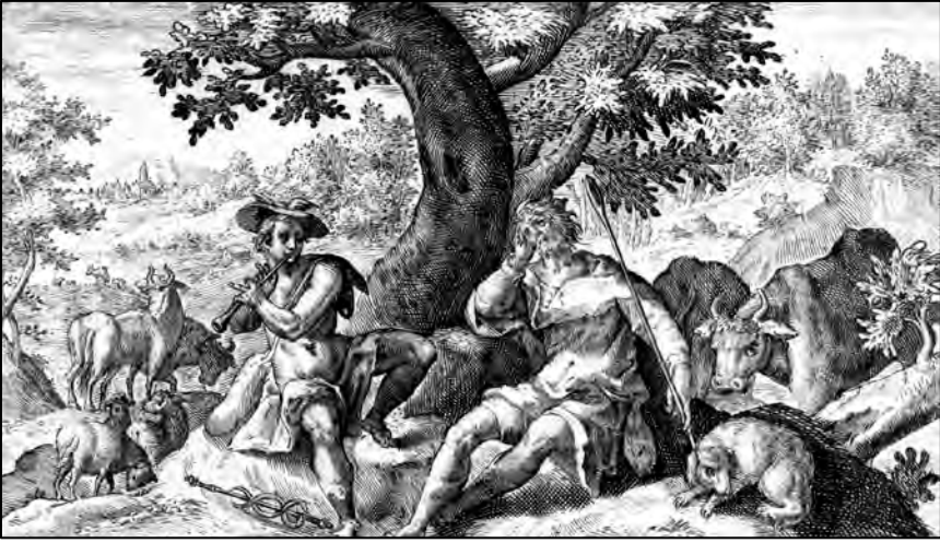
Mercury and Argus

The worship of Bacchus-Dionysus seems to have originated in Phrygia and Thrace, travelled across the Aegean via Chios and Naxos, and from there arrived at ancient Thebes, so that Ino of Thebes is asserted to have been his foster-mother. He also travelled eastwards to India. He was perhaps a barley-god, consort of the great Goddess as Astarte. The twice-born god of the vine, Dionysus, like Apollo, lives at the extremes. His followers are intoxicated, maddened, lost in the mindless ecstasy beyond responsibility, so that he is a god of the formless, of the void outside civilisation, which is ignored at our peril. Where Apollo brings inspiration and awareness of the possibilities of form, Dionysus brings realisation, and awakening, the awareness of inner powers. The great crime is to fail to recognise and acknowledge him, to fence him out from the civilised centre, or submerge him in mediocrity.