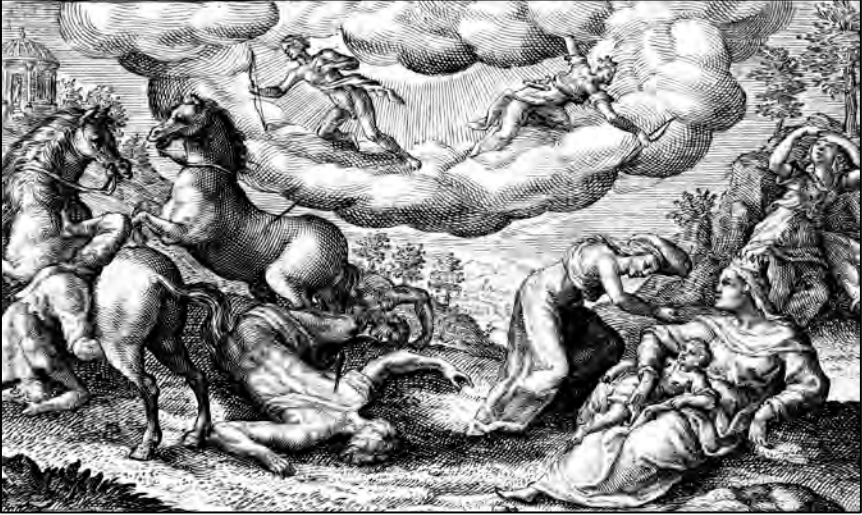
The death of Niobe's children