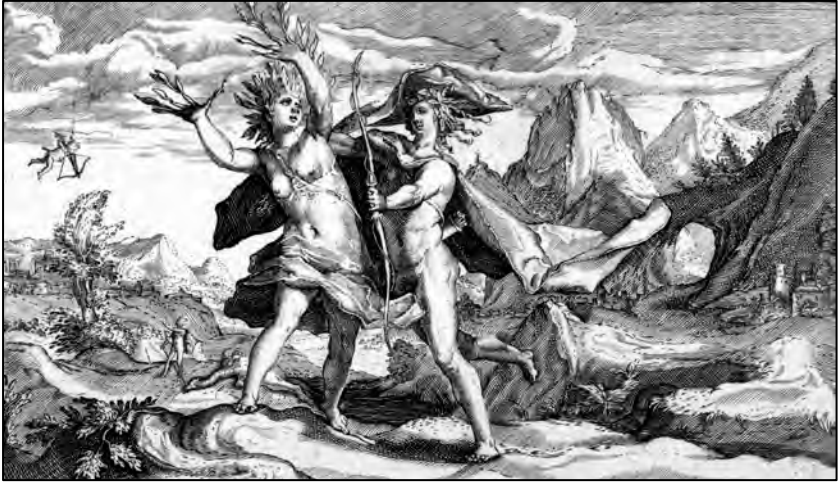
Apollo pursues Daphne

Of the handful of flowers Hyacinthus (Book X:143), who shares his flower identity with Ajax (Book XIII:382), Crocus, whose lover Smilax becomes the flowering bindweed (Book IV:274), and Narcissus (Book III:474) are obvious examples, while Adonis becomes the anemone (Book X:708), and Clytie the heliotrope (Book IV:256). All are 'lovers' except Ajax, he being chosen to account for the markings on his flower. Hyacinthus is loved by Phoebus, Crocus by Smilax, Narcissus loves himself, Adonis is Venus' consort, Clytie loves Sol.