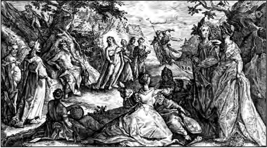
Apollo and Pan

His child Aesculapius can resurrect the dead, restoring Hippolytus to life (Book XV:479), and Apollo himself heals human hurt, though he cannot heal his own wound from Cupid's weapon, his love for Daphne (Book I:438). Here, on the borderland of human affairs, in illness, and prophecy, Apollo has effect, and in artistic inspiration, when the mind and the hands and the heart fly free. He is called 'leader of the dance of the Muses' (Pausanias Book I.2.5). He competes with and defeats Pan's reed-pipes (Book XI:146) and Marsyas' lyre, Marsyas who is flayed, yielding a stream of blood, but transformed into river water (Book VI:382). Apollo's music lifts the stones that build Megara, and leaves the notes resonating in the walls (Book VIII:1). And he helps Neptune build Laomedon's Troy, perhaps with the same mysterious, magical harmonies (Book XI:194). Aesculapius, his son, brings the dead to life, while Orpheus his poet, son of the Muse, Calliope, walks among the dead, and is himself killed by Dionysus's Maenads, his oracular head, speaking Apollo's prophecies, floating down the Hebrus to reach Lesbos at last, where Sappho, perhaps, will continue the immortal song (Book XI:1).