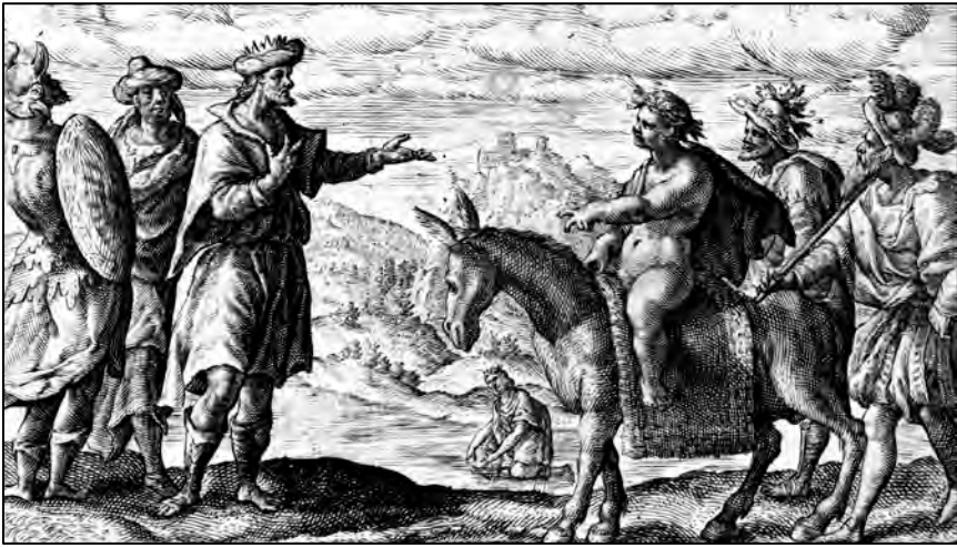
Bacchus honours the wishes of King Midas

disturbs Ovid, the vegetarian. Heroic quasi-religious quest too is outside his scope, despite the appearance of Perseus, Theseus and Hercules, in vignettes from their hero cycles. When the rituals of religion do appear, those of Isis for example (Book IX:666), they are already softening towards the religion of the personalised deity, of the gods and goddesses of every-man and every-woman, precursors to Christianity. It is interesting that at the holiest sanctuary of Isis in Greece at Asclepius, no one could enter the holy place except those personally chosen by Isis and summoned by visions in their sleep (Pausanias X.32.9). In the Metamorphoses , Isis asserts female rights, and reveals the human face of the goddess, before bringing mercy to Telethusa, and Iphis, in just such a vision. In a similar instance of personal communion Bacchus forgives Midas (Book XI:85) by prompting him to a ritual cleansing akin to baptism.