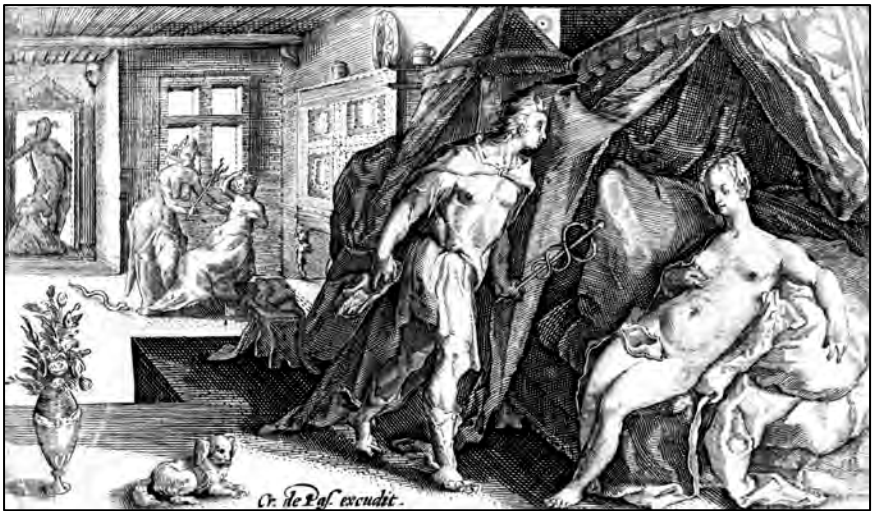
Mercury and Herse

Venus-Aphrodite gave birth to the god of love, Cupid, or Eros as the Greeks knew him. His father was Mars, the war-god who committed adultery with Venus in her husband Vulcan's bed, and who was caught with her in that smith's bronze net (Book IV:167). Hence derives the aggression of lust, and the wars of love. Or in another version Hermes-Mercury, a phallic god, was the father, and love was also filled with that mental agility of wooers and wooed. Or the goddess committed incest with her father Jupiter-Zeus, and passion inherits that excess and disdain for boundaries. Cupid with his bow and arrows is Venus' wayward child, causing even the gods to be blinded by passion, just as he is depicted blind: making Apollo desire Daphne (Book I:438), Dis be filled with a passion for Proserpine (Book V:332), and his own mother Venus fall in love with Adonis (Book X:503).