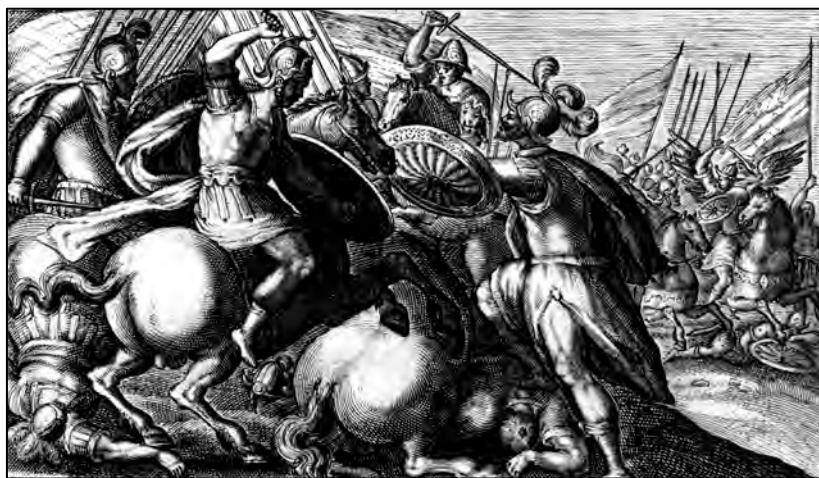
Cygnus battles with the Trojans against the Greeks