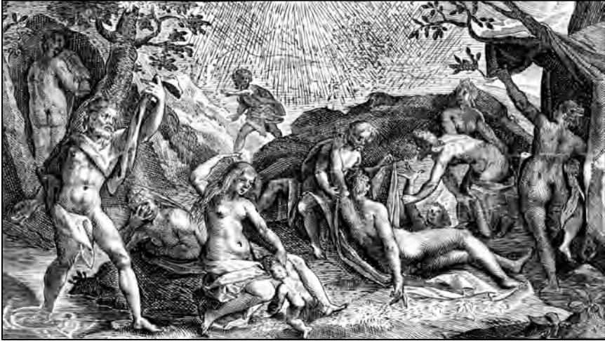
The Great Flood

nature as life-giver, she is Juno-Hera, sister-wife of Jupiter-Zeus, goddess of brides and women in labour, she is Ceres-Demeter, guardian of the crops, and mother of Proserpine-Persephone the force of seasonal change, and she is Cybele, ancient fertile mother goddess of Asia, and Isis, grieving wife and mother of Egypt.