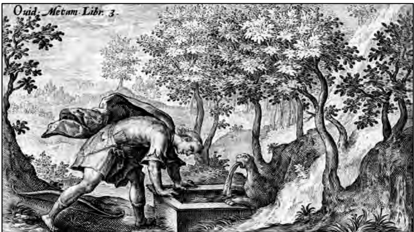
Narcissus falls in love with his own reflection

Of the handful of flowers Hyacinthus (Book X:143), who shares his flower identity with Ajax (Book XIII:382), Crocus, whose lover Smilax becomes the flowering bindweed (Book IV:274), and Narcissus (Book III:474) are obvious examples, while Adonis becomes the anemone (Book X:708), and Clytie the heliotrope (Book IV:256). All are 'lovers' except Ajax, he being chosen to account for the markings on his flower. Hyacinthus is loved by Phoebus, Crocus by Smilax, Narcissus loves himself, Adonis is Venus' consort, Clytie loves Sol.