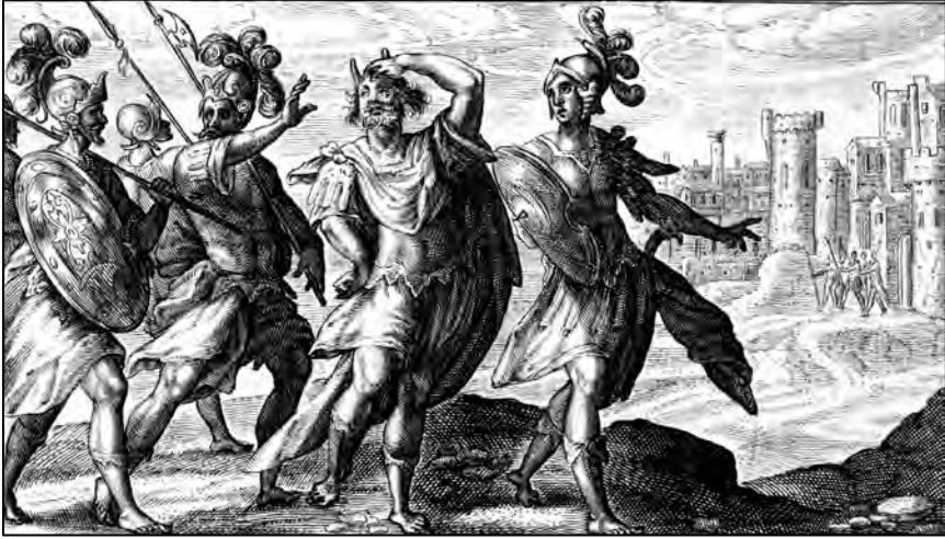
Cipus approaching Rome

civilisation for the world, appreciates it even more when he is exiled from it on the borders of Scythia, and so he endorses the Roman destiny, a popular sentiment. Perhaps he convinced himself it was so. He does not however write the epic of Augustus.