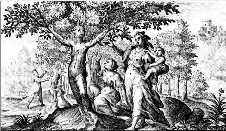
Dryope picking the blossom