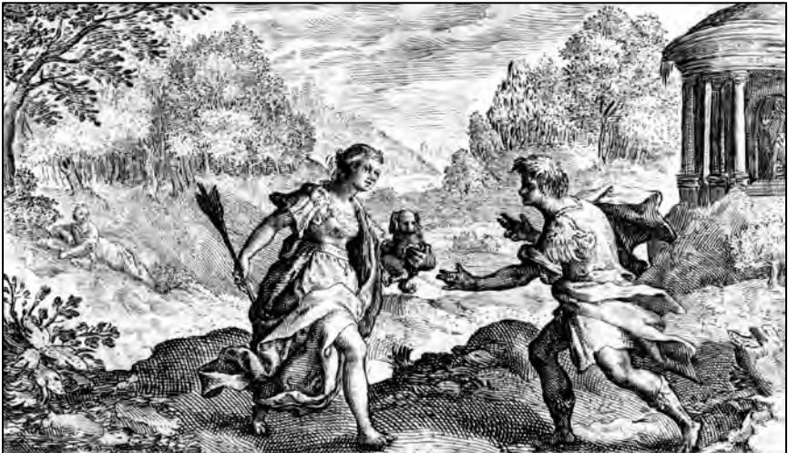
The reconciliation of Cephalus and Procris

Love flirts always with betrayal, eroticism may overpower the heart, the magnetic power of sexuality may defeat the mind. Jealousy may corrupt the lover: that yearning for a wrongful possession of the beloved, a reduction of person to object. The idea of adultery may pierce the loving soul. The adulterer may reject and scorn and abandon the once beloved. Envy or greed or garrulity may prompt the informer to betray the lovers. Theseus forsakes Ariadne (Book VIII:152), Jason abandons Medea (Book VII:350), Aglauros is touched by Envy, jealous of Mercury’s love, for her sister Herse, and is ‘eaten by secret agony’ (Book II:787). The Raven betrays Coronis to Apollo (Book II:596) and truth is his downfall. Scylla betrays her father and her city, Megara, for love of Minos (Book VIII:1), while Clytie condemns her rival Leucothoe, for the sake of the dazzling Sol (Book IV:214) and his daughter Circe condemns the other Scylla in her jealous desire for Glaucus (Book XIV:1).