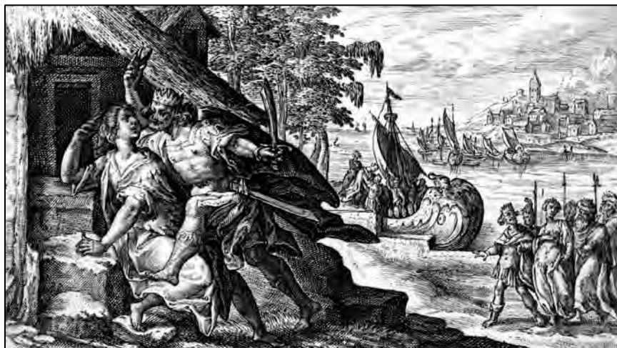
Tereus cuts out Philomela's tongue

Venus-Aphrodite is the goddess of the whole spectrum of love, from lust and sexual obsession, through desire and mutual attraction, to long and faithful affection, and even a loving mourning for what is lost. She attends weddings, and she hovers over adulterers. She binds the loyal, and she encourages to betrayal. Myrtle is her plant, and Aphrodite's 'berry' is the clitoris, as well as the fruit of that tree. The Metamorphoses is a work implicitly dedicated to her, as goddess of the Roman race, but also as goddess of that love, that admiration for the feminine, that is the core of Ovid's writing. The inscription on the statue of Aphrodite, sculpted by Alkamenes, standing near her shrine in the Gardens at Athens, proclaimed that: 'Heavenly Aphrodite is the oldest of the Fates.' (Pausanias I.19.2).