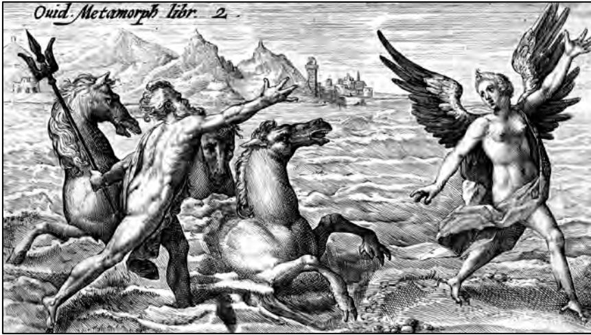
Neptune and Coronis

His fluid, Protean brother, Neptune-Poseidon, ruling the second realm of the oceans, because of his inherent formlessness, like Jupiter, is required to display his (lesser) power in other shapes. He possesses girls while disguised as bull, ram, bird and dolphin. He, rather than Aegeus, having slept with Aethra may have been the father of Theseus (Book IX:1), whose fate was bound up with the bull of Minos (Book VIII:152), and whose son Hippolytus was to meet with a fateful bull from the sea (Book XV:479) near Neptune's sacred city of Troezen. As a horse-god, white sea-breaker, stallion of the waves, he took Ceres-Demeter, as she grazed in the form of a grey mare among the Arcadian herds (Book VI:103). He himself created horses: invented the bridle, and instituted horse racing. And he was the father of Neleus by Tyro, who was in turn Nestor's father (Book II:676), Nestor whom Homer calls 'the horse-man' ( Odyssey III). Neptune having raped Medusa in Minerva's temple, she bore him Pegasus, the winged horse (Book IV:753). A shape-changer himself, and perhaps identified with Proteus the shape-changing sea-god, he gives that power to Mestra (Book VIII:843), and to Periclymenus (Book XII:536). And as the father of Polyphemus, he pursues that Odysseus who blinded his son (Book XIV:154, and Odyssey I, V, VI, VIII, and IX), over the waters, holding him back from Ithaca, and his Penelope.