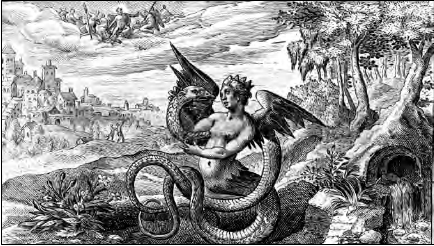
Cadmus and Harmonia turned into a serpent