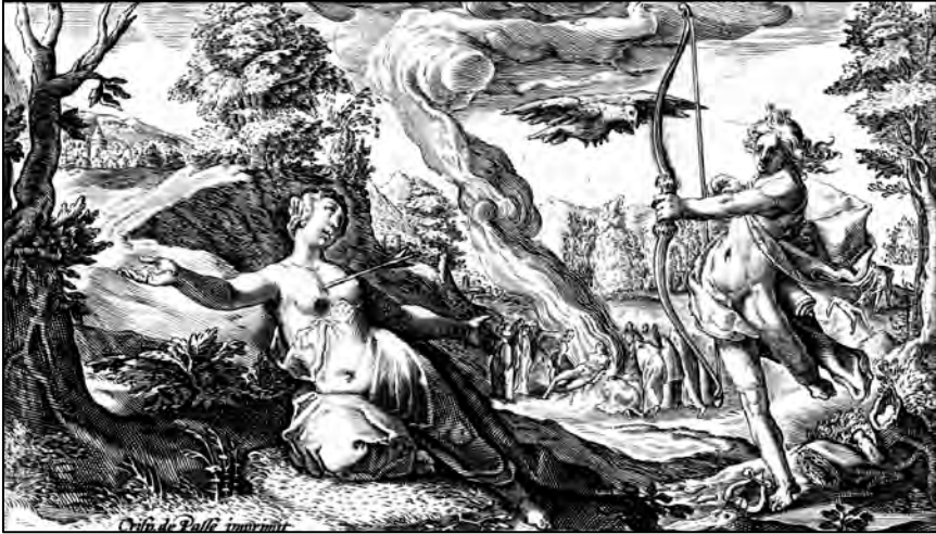
Apollo kills Coronis

regret, laments for her, and plucks their child, Aesculapius, the healer, who inherits his father's divine gift, from her dead womb (Book II:612). He loves Dione (Book IX:439), and Chione, their son Philammon receiving his gift of music (Book XI:266), and Isse, whom Arachne depicts with him (Book VI:103), and Dryope, sadly changed through error (Book IX:324).