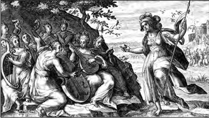
The Muses sing for Minerva

into death, and was lifted by Apollo into the air on hawk's wings, in transformation. (Book XI:266). She ranged herself with Apollo her brother to punish Niobe for her pride (Book VI:267). Yet she can pity too, on occasion, when man is driven by her to inflict cruelty on woman, so she spirits away the tragic Iphigenia, sacrificed by her father for the sake of a favourable wind for the passage to Troy, and transports her to Tauris, leaving, at Aulis, a phantom hind as a substitute sacrifice (Book XII:1).