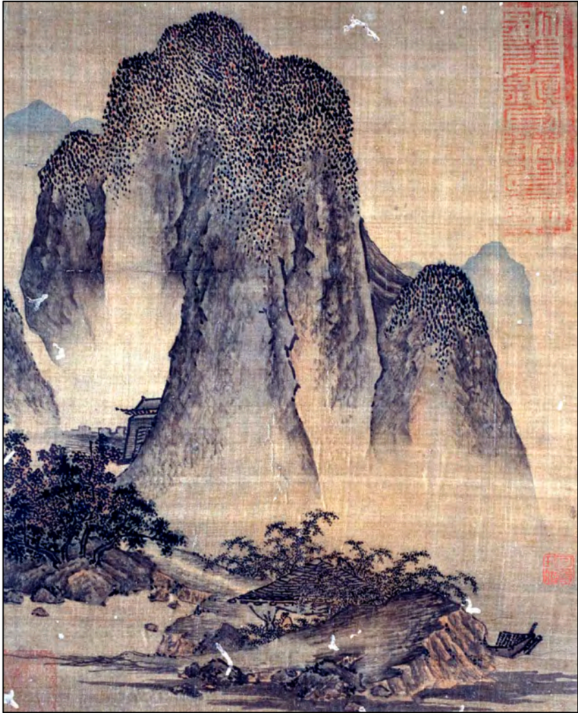
Landscape in the Style of Fan Kuan (14 th - 15 th century)