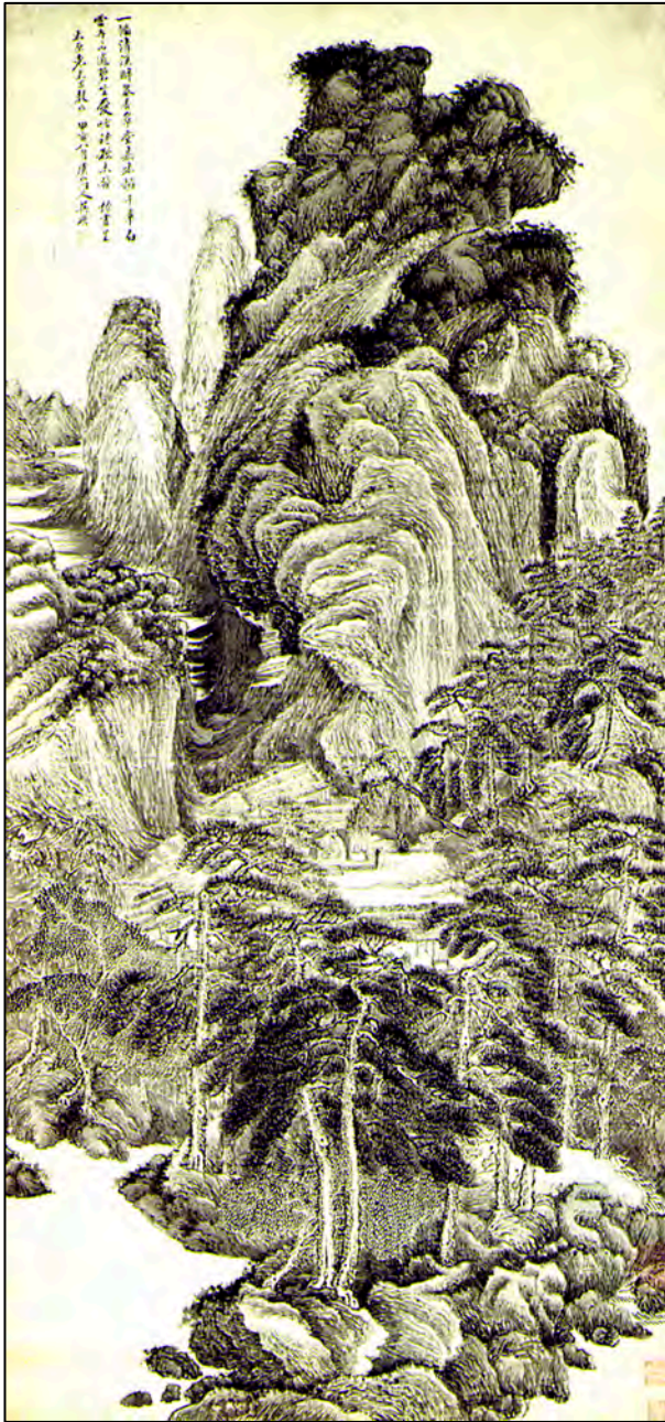
Reciting Poetry before the Yellowing of Autumn, Wu Li (1632 - 1718)