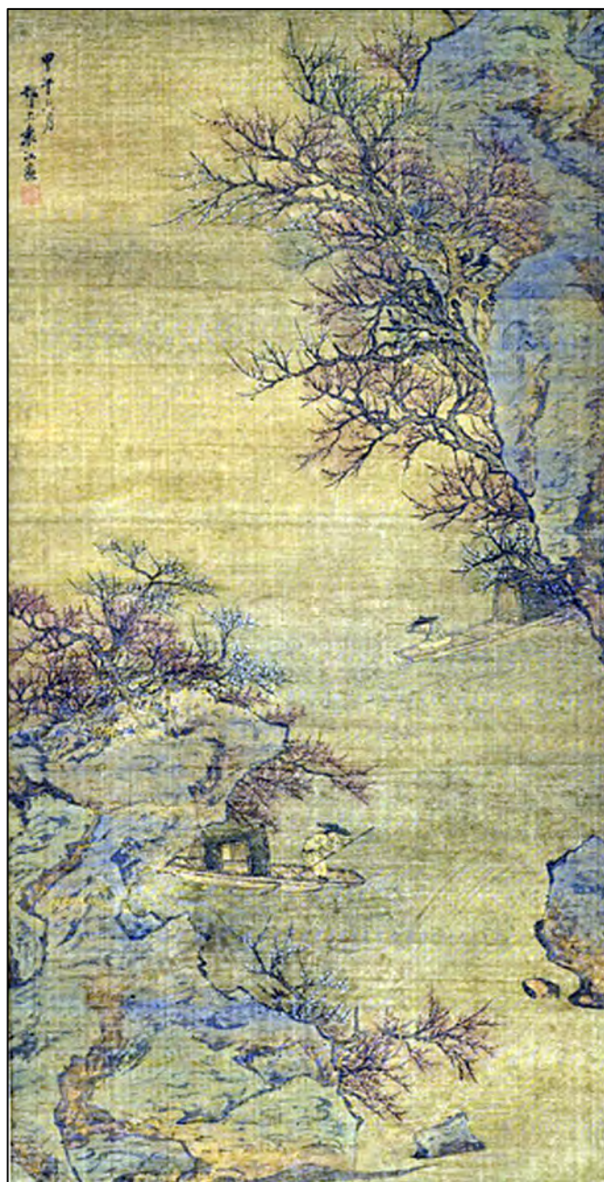
River-Crossing in the Spring, Yuan Jiang (1691 - 1746)