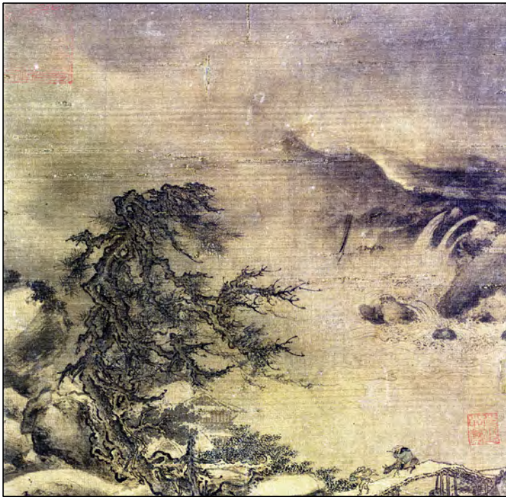
Winter Landscape, Li Shan (12 th century)