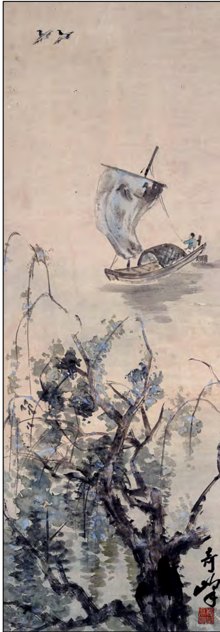
A Fisherman in a Landscape, Gao Qifeng (1889 - 1933)