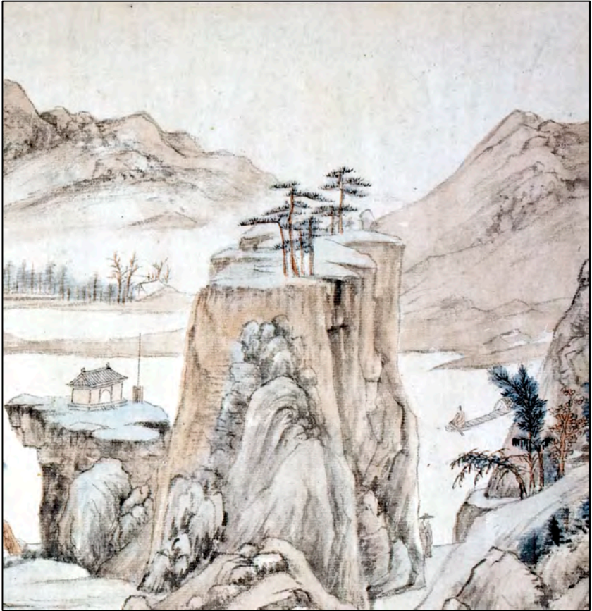
Dream Journey among Rivers and Mountains, Cheng Zhengkui (1604 - 1676)