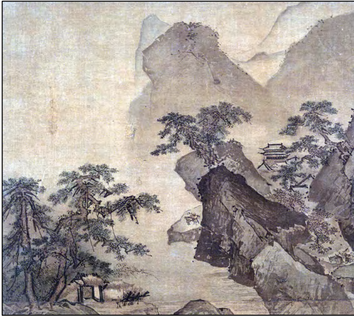
Mountain Landscape, Li Di (early 15 th century)