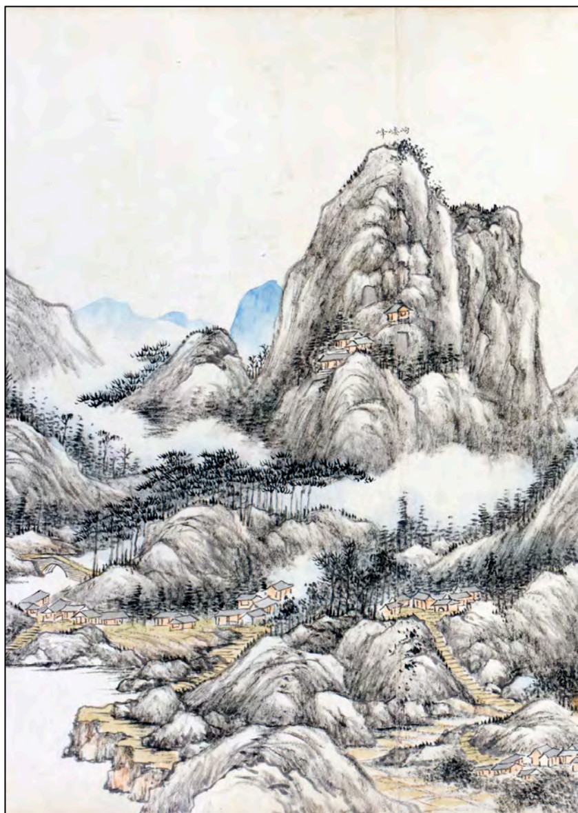
Traveling to the Southern Sacred Peak, Zhang Ruocheng (1722 - 1770)