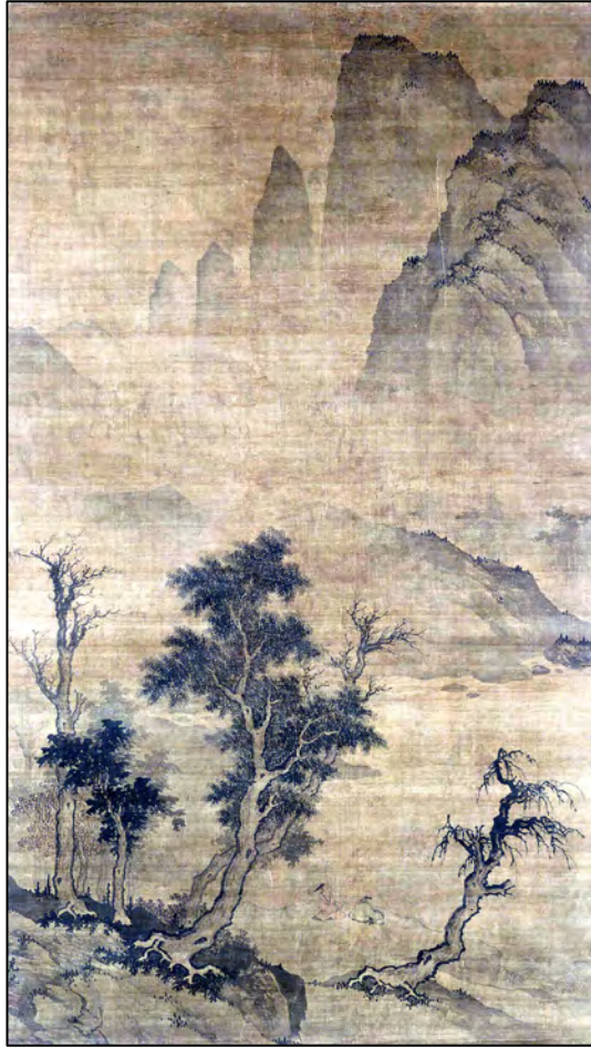
Scholars in a Landscape, 16 th century