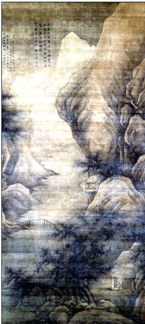
Landscape, Jin Kan (d. 1703)