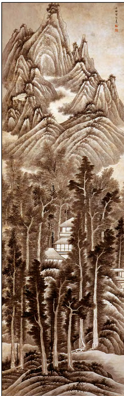
Lofty Peak and Dense Woods, Gong Xian (1656 - 1682)