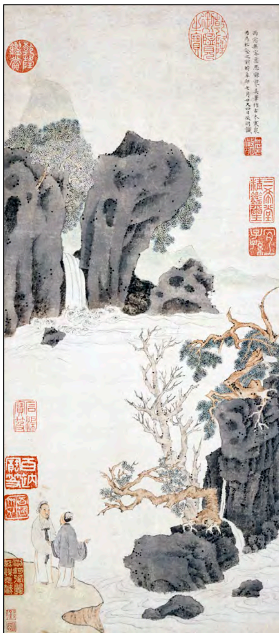
Old Trees by a Cold Waterfall, Wen Zhengming (1470 - 1559)