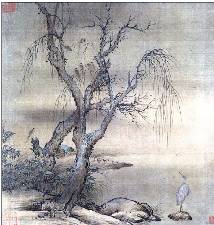
An Autumn Scene with Birds, Xu Daoning (10 th –13 th century)