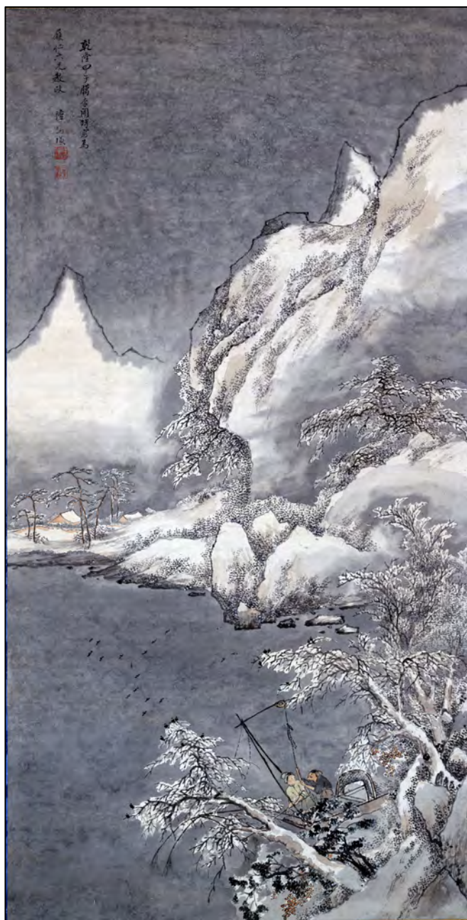
Fishermen on Snowy River, Lu Mingqian (1744)