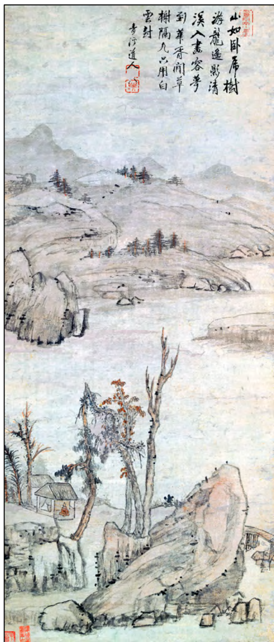
Reflections in a Clear Stream, Cheng Zhengkui (1604 - 1676)