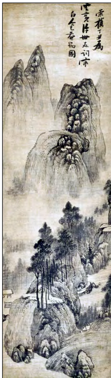
Landscape, Zhang Ruitu (1570 - 1641)