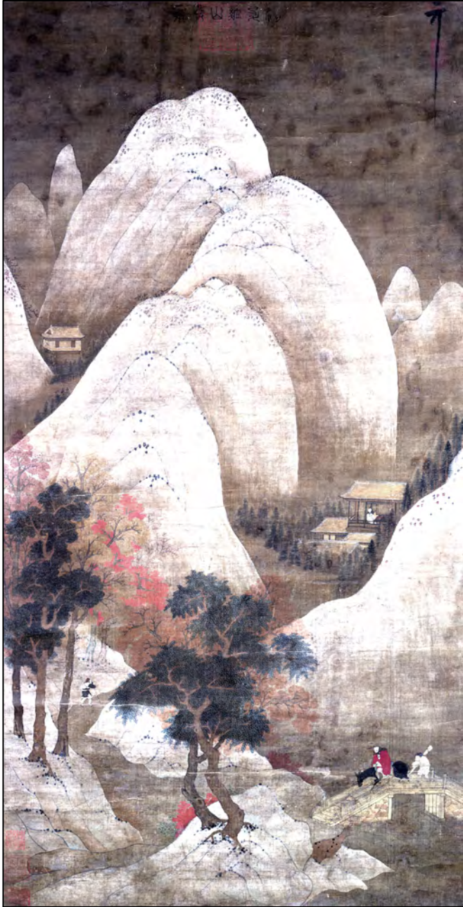
Clearing after Snow in Streams and Mountains, Yang Sheng (17 th century)