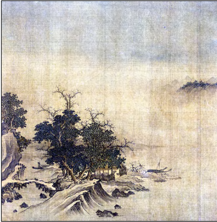
Fishing Village in Moonlight, Gu Liang (15 th century)